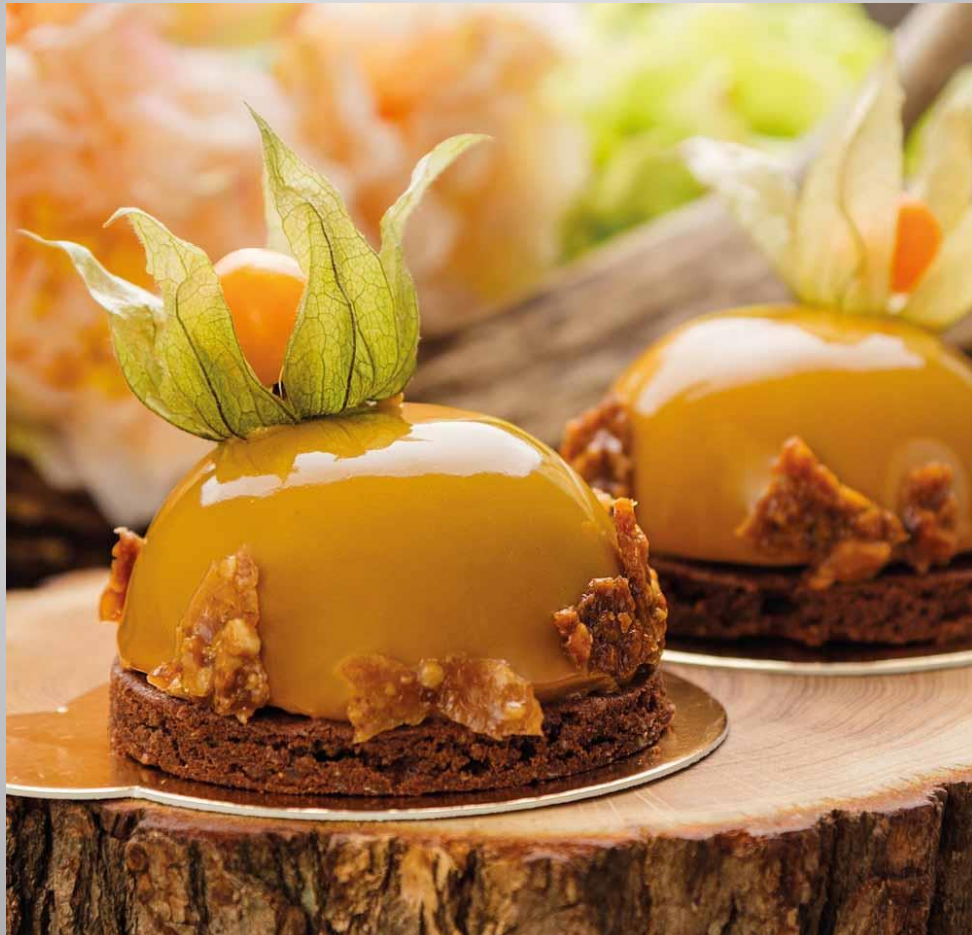
Use to garnish desserts