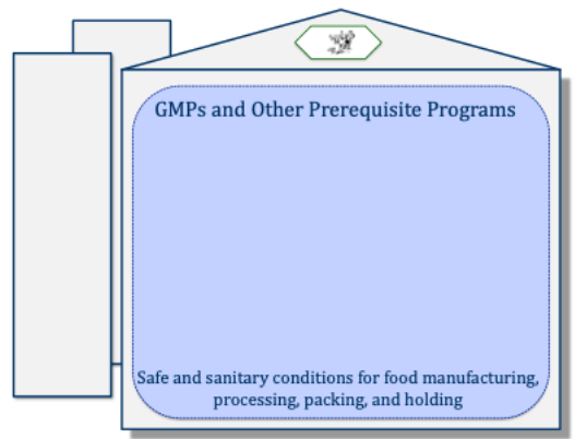
GMPs and Prerequisite Programs are the foundation of food safety in a dairy processing facility.

Prerequisite Programs (PPs) are universal programs, practices, and procedures that provide the basic environmental and operating conditions necessary to produce safe food in a sanitary environment. PPs include GMPs, and may also include programs such as water safety for the whole facility, overall sanitation procedures, and preventive maintenance programs. Prerequisite Programs are not specific to any individual food.