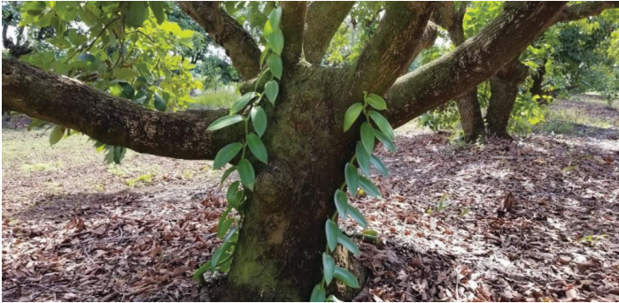
Figure 6. V. pompona growing on an avocado tree. Vines were received as 1-meter-long cuttings. Growth is after one year without supplemental irrigation.

Vanilla vines require trellising to maximize production. Two major production methods are used. One uses “tutor” trees to provide both shade and a suitable structure on which the vines can climb. Tutor trees can be selected based on hardiness in a given location, availability, and co-cultivation considerations. This type of cultivation can be less expensive in some areas and naturally reduces the risk of vine death by Fusarium by increasing the distance between plants. Growers in southern Florida could consider vanilla as a secondary crop on existing fruit trees. Figure 6 shows V. pompona growing on an avocado tree. Any agricultural inputs will have to be compatible with both species under the intercropping model.