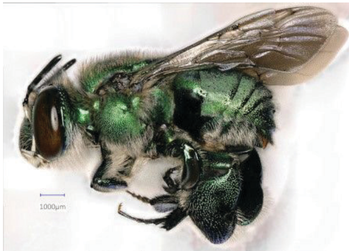
Figure 2. Euglossa dilemma lured and captured at the UF/IFAS Tropical Research and Education Center. This bee could be a pollinator of vanilla orchids.

Auto-pollination of V. planifolia flowers is rare to nonexistent in regions where native pollinators (bees and perhaps hummingbirds) do not occur. Though not native, the orchid bee Euglossa dilemma (Figure 2) has become established in southern Florida and could potentially be a pollinator of vanilla orchids. In parts of Mexico and Florida, pollination has been observed in natural areas without human intervention (Figure 3). One hypothesis is that Euglossa dilemma , or an unidentified native orchid pollinator in southern Florida, could be pollinating the Vanilla flowers, reducing the need for manual pollination.