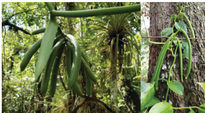
Figure 3. Bean development in the absence of manual pollination for V. phaeantha (left) and V. mexicana (right) in natural areas.