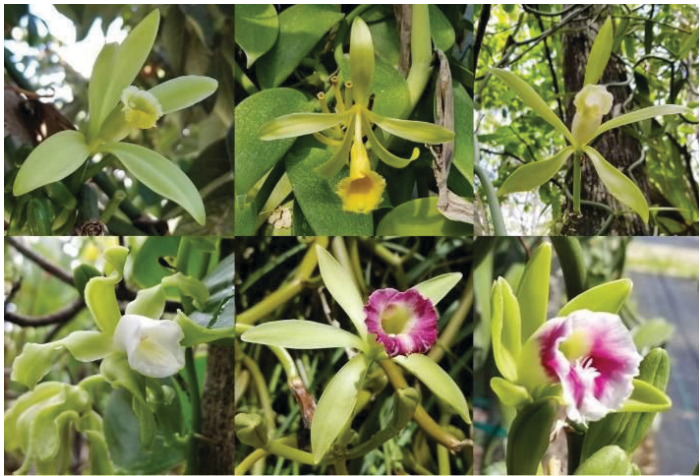
Figure 1. Flowers of V. planifolia (top left), V. pompona (top center), V. phaeantha (top right), V. mexicana (bottom left), V. dilloniana (bottom center), and V. barbellata (bottom right) growing in southern Florida.

Florida has four native vanilla species: V. barbellata , V. dilloniana , V. phaeantha , and V. mexicana . The species V. planifolia is naturalized (Figure 1), and V. pompona is also common among gardens in southern Florida. The native Florida vanilla species are endangered and should not be collected from natural areas without proper authorization and permitting by regulatory authorities. Puerto Rico has six species growing wild: V. barbellata , V. dilloniana , V. poitaei , V. pompona , V. claviculata , and V. planifolia .