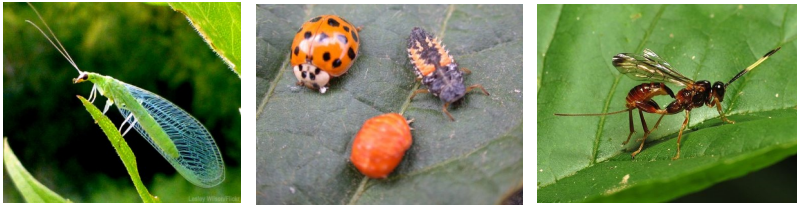
Image 3. Beneficial insects (left to right): lacewing, ladybeetle (adult, larvae, pupa, from upper left, clockwise), parasitic wasp.

Leafhoppers were more prevalent in June/July and feed on leaves and stems with piercing sucking mouthparts that extract fluid from the plant. Most leafhoppers feed on the phloem of plants and have insignificant effects on plant growth and show no symptoms. Some leafhoppers may feed on the mesophyll and make a small, light flecking injury to the feeding site. They can also transmit plant pathogens, however, leafhopper-vectored diseases have not been observed so far. As such, leafhoppers may appear on hemp but are unlikely to cause significant damage. Leafhoppers will lay eggs in leaf tissue that overwinter, hatch in early spring, and then continue to lay eggs throughout the season.