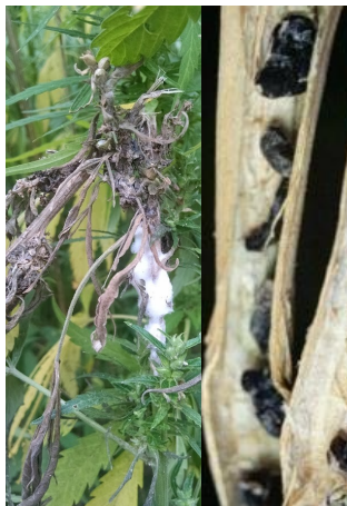
Image 1. Sclerotinia sclerotiorum , common on industrial hemp on the seed head and stalk.

Regular scouting of hemp is a way to monitor pest populations and potential problems that may arise. To scout your hemp plants, examine the top and undersides of leaves on low and high portions of the plant stems. Choose random plants throughout your field to gain a representative view of the entire planting. Currently, industrial hemp is a minor use crop and there are no registered pesticides available for its use.