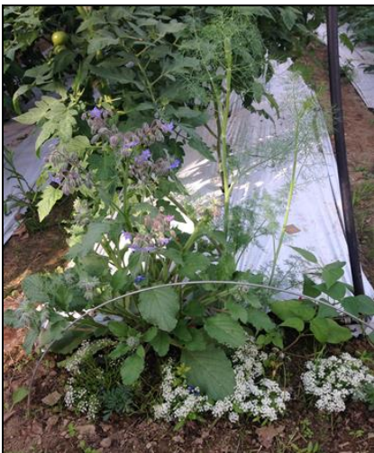
Habitat plants in tomatoes.

Plant-mediated IPM systems (e.g., indicator, banker, and habitat plants) offer innovative, plant-based tools to manage aphids and other pests in high tunnels at low inputs. We have multi-year projects to evaluate these IPM systems for