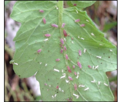
Potato aphids infesting tomato.

Aphids are the #1 pest of vegetables in Northeastern high tunnels. They stunt plant growth, secrete sticky honeydew, transmit virus diseases and cost growers considerable time and resources to manage. To combat aphids, some growers spray chemical insecticides, which pose a threat to human health and the environment. Organic growers either do nothing, or spend a lot of money on frequent releases of natural enemies.