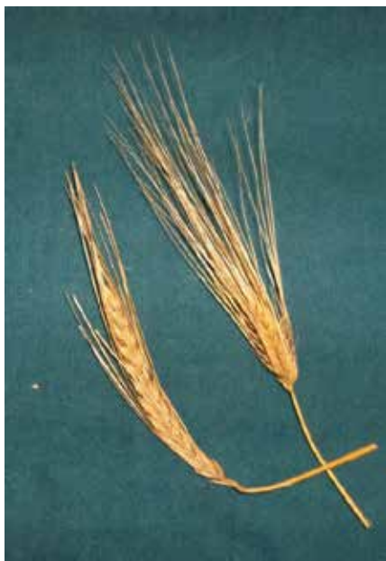
Figure 2. Six-row (top) and two-row (bottom) barley types.

so) than the best adapted feed barleys. This would be due to a combination of less-adapted lines and perhaps slightly lower nitrogen rates. For winter barley in areas where it is best adapted, yields of 60 to 90 bushels per acre should be possible. For spring barley in northern Pennsylvania, yields of 40 to 80 bushels per acre should be feasible.