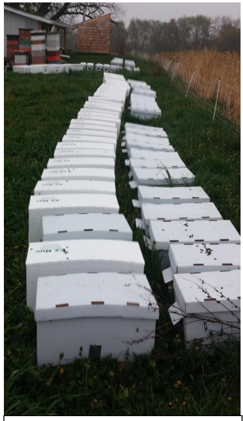
Rows of nucs ready for sale to beekeepers in the spring.

The basis of the proposed method is the use of late season splits. This means splitting colonies after the main honey flow as a way to increase your overall number of colonies. Not only does a system of late season splits allow for the production of replacement colonies, but it also has benefits that improve colony survival. It does this through both the reduction of disease and a focus on younger and better queens.