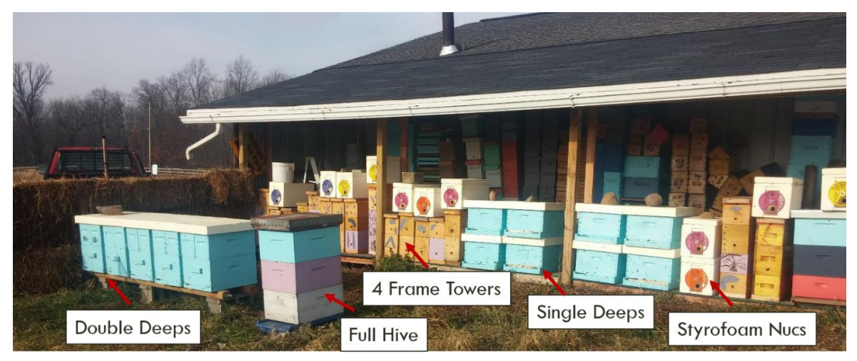
All of the equipment for the study was purchased from Betterbee.