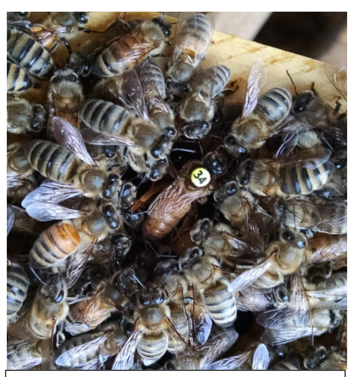
A VSH breeder queen. By late summer I should have a good idea of what colonies are doing best, and which ones I should replace with new, and better genetics.

Late season re-queening can improve colony success in multiple ways: younger queens do better in spring build-up, are less likely to swarm in spring, and different queens have different genetics that can improve survivability and colony success. This system of late season splits takes advantage of all of these factors to improve survival. Because you are requeening/splitting after the main honey flow, you can take the time to find queens with the genetics that you want. It is also easier to find queens from northern stock later in the season. In Michigan, I generally can't start raising queens until mid-May (in my zone, our last frost free date is May 10, though in 2016, we had snow May 16). Even if the cells don't chill in mating nucs, we often won't have warm enough weather for consistent mating flights or enough drones to ensure that the queens are well mated if I start earlier. That means that northern queens are hard to come by for