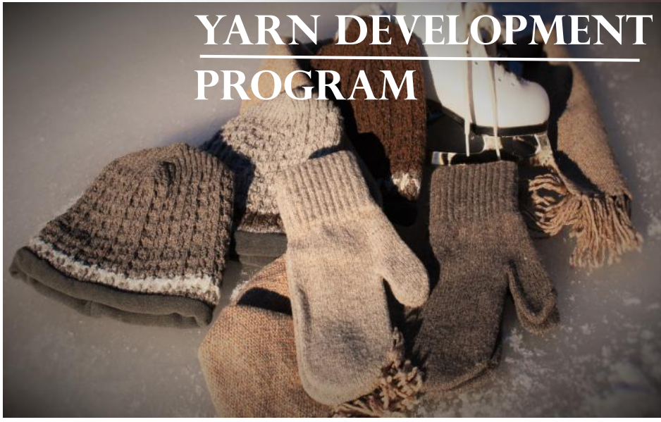
MMW Finished Products

Mountain Meadow Wool's value and respect for nature, ethics, and sustainability, has spurred manufacturing practices that are