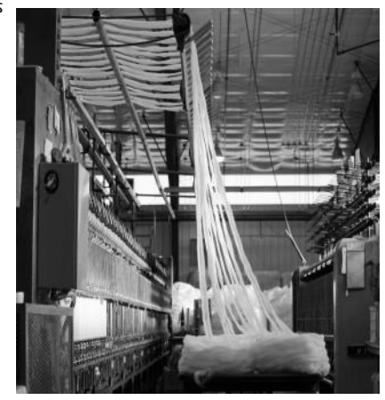
MMW Spinning Frame

eco-friendly and natural. Greener practices have helped create luxurious yarns that are soft and have a more natural connection to the land. Mountain Meadow Wool has continued to expand their yarn lines and explore new and exciting innovations in wool fiber.