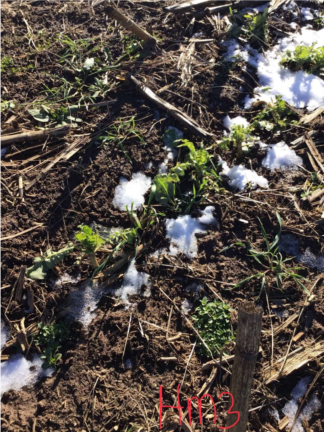
HM3 growth late November.