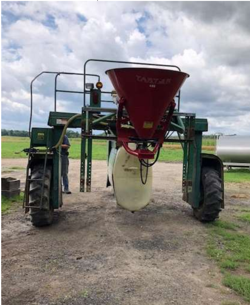
Interseeder Close Up