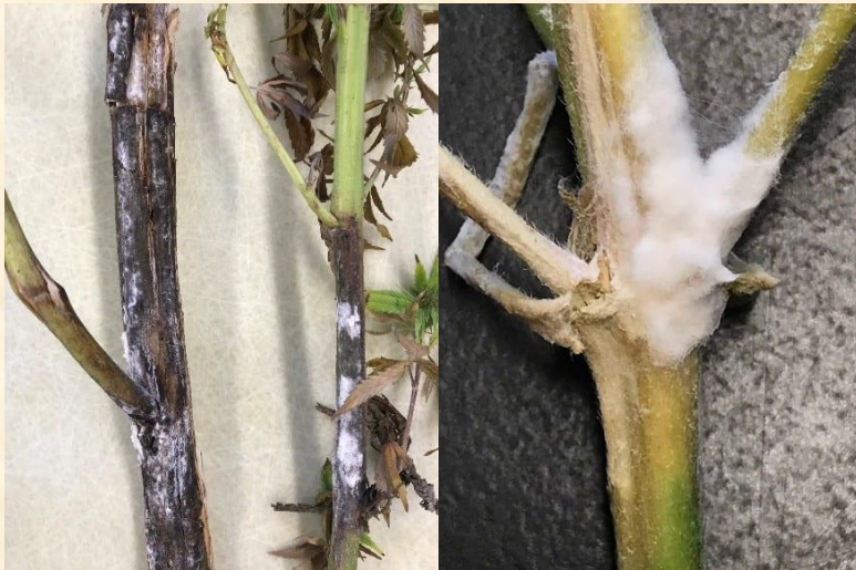
Sclerotinia White Mold

Sclerotinia white mold affects hemp stems and is best managed by crop rotation. However, white mold presents a management challenge because several crops and weeds are alternate hosts. Prevention requires good weed control, especially of broadleaf weeds, and a robust crop rotation schedule that avoids host crops such as soybeans, forage legumes, and many vegetable crops. Sclerotinia sclerotium is the causal agent of white mold and produces survival structures that can survive in the soil for 2+ years.