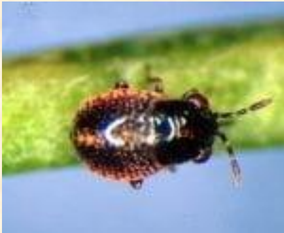
Big-Eyed Bug on a Stem

Natural enemies play an important role in the management of agricultural pests. Given the lack of approved pesticides and pesticide efficacy data on hemp grown in New Jersey, hemp growers may wish to encourage natural enemy populations to aid in biocontrol of pest species. Examples of these beneficial insects include Big-eyed bug ( Gercoris spp.), damsel bugs, Syrphid flies, Convergent Lady Beetle ( Hippodamia convergens L.), Minute Pirate Bug ( Orius insidiosus ), Green Lacewings ( Chrysoperla rufilabris L.), and Brown Lacewings ( Hemerobius spp.). More information on these species can be found here . For information on best management practices to encourage these beneficial insects on your farm, visit Michigan State University's Native Plants and Ecosystem Services website and check out ATTRA's publication: "Farmscaping to Enhance Biological Control."