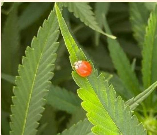
Lady Beetle