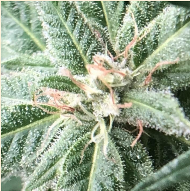
Clear trichomes on hemp plant, Photo by William Bamka