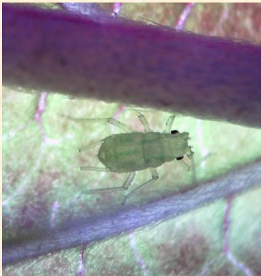
Cannabis Aphid on Hemp.