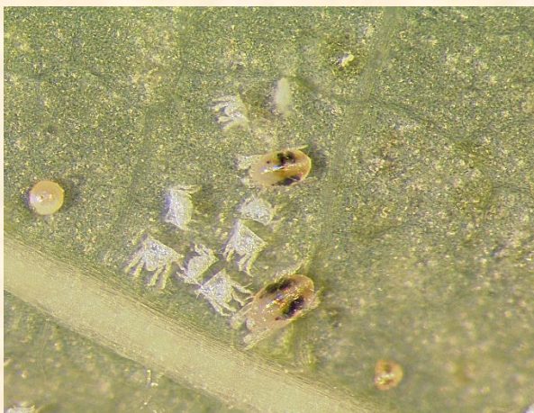
Two-Spotted Spider Mite