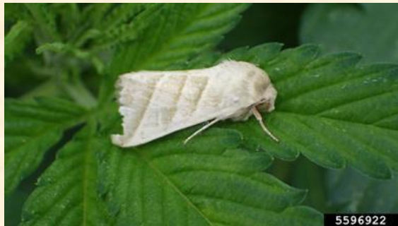
Tobacco budworm moth. Photo by Whitney Cranshaw, Colorado State University, Bugwood.org CC BY - 4.0