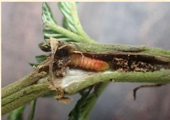
Eurasian Hemp Borer