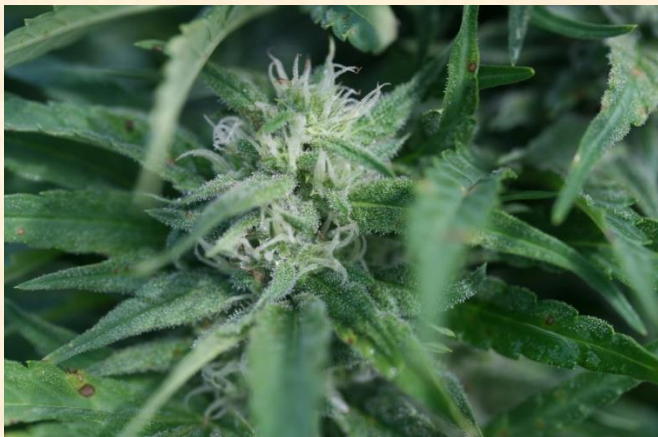
Immature bud and trichomes on a CBD hemp plant.