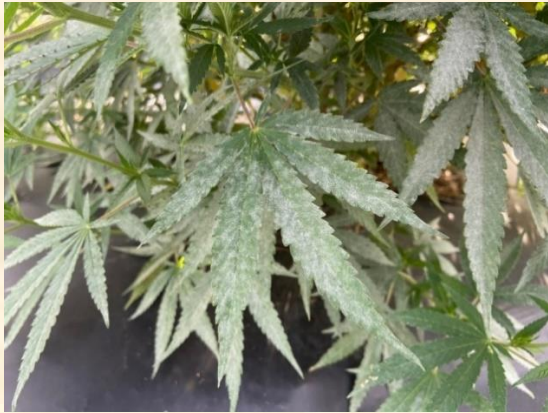
Powdery mildew.

Powdery mildew is a common foliar disease under high humidity conditions. In the 2020 hemp trials in NJ, Golovinomyces sp. was isolated from hemp transplants with powdery mildew and determined to be the causal agent locally. Many other states also report powdery mildew infections on hemp. Nearby hemp or cucurbit fields, as well as infected crop residue, may serve as inoculum sources. Greenhouse production favors powdery mildew infection due to higher humidity, reduced airflow, and moderate temperatures compared to field production.