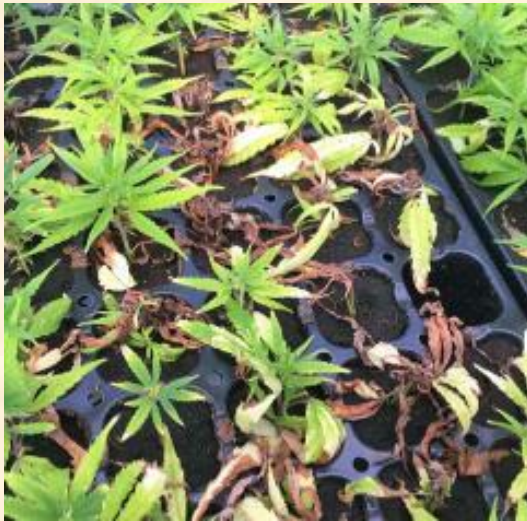
Damping-off in the greenhouse.

Damping-off is a phenomenon that occurs in seedlings, clones, and young transplants and is caused by Pythium spp. and Rhizoctonia solani . Damping-off is favored by wet soil conditions and high soluble salt content. Plants under stress are also more susceptible to infection. Infected plants will often exhibit characteristic wilting and often a lesion or girdling at the soil line. Good greenhouse sanitation is essential along with use of well-drained, disease-free planting medium. Use clean water and do not reuse planting medium to avoid introducing these pathogens. Discard infected plants and quarantine nearby plants.