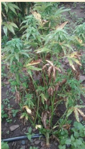
Fusarium Wilt on hemp

Several species of Fusarium infect hemp plants causing Fusarium wilt and Fusarium crown rot . Fusarium spp. result in systemic, vascular infections by infecting hemp roots, crowns and stems. These fungal pathogens persist on crop residue and in soil and spread through the movement of soil or airborne spores.