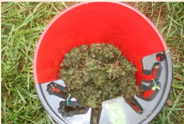
Bucket lid debudder for bud removal from stem