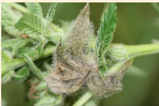
Botrytis gray mold

Botrytis gray mold is caused by Botrytis cinerea . Gray mold is favored by high humidity, poor airflow, and moderate temperatures. Infection is most common in flower buds but can be observed on all plant parts. Infection enters through a wound or opening in plant tissue. Reducing injury to plants and maximizing airflow in the plant canopy may reduce incidence of disease.