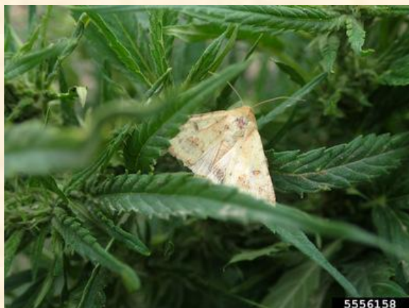
Corn earworm moth, Photo by Whitney Cranshaw, Colorado State University, Bugwood.org CC BY - 4.0