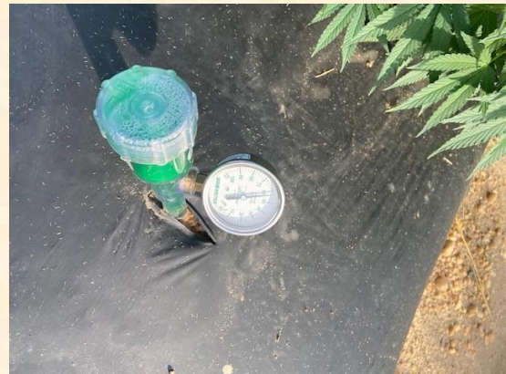
Tensiometer in the field displaying moisture levels in the root zone.

Test your soil several months (at least 6 months) before planting and apply lime and fertilizers as needed to obtain optimal optimum yields.