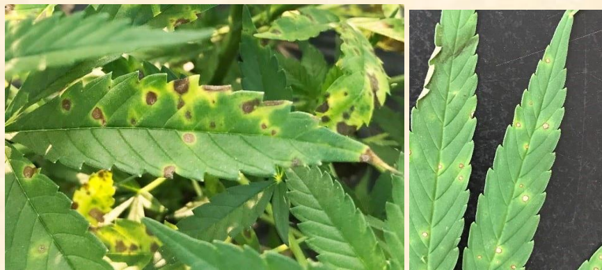
Septoria leaf spot

Leaf spots caused by fungal pathogens Septoria sp. and Bipolaris sp. was commonly observed in our 2020 hemp trials. Fungal leaf spots are widely reported in New York, Kentucky, and several other states where high disease impact has been observed. Even at sites where hemp had not previously been grown, leaf spot diseases were reported in NJ, so weeds are considered an alternate host. Leaf spot inoculum can also persist in the soil and on crop residue. Infection is favored by hot, humid weather following rain which can also spread inoculum through wind and soil splash. There are several other fungal genera that cause leaf spots on hemp.