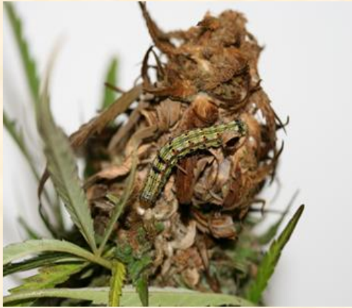
Corn Earworm on Hemp Bud, Photo by Stephen Komar