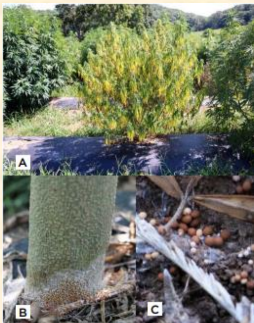
A) Plant in the field displaying wilt and leaf yellowing resulting from southern blight infection B) White fungal growth and tan/brown sclerotia are observed near the soil line on a hemp plant infected with southern blight. C) A close-up view of the hardy overwintering sclerotia, which resemble mustard seeds.