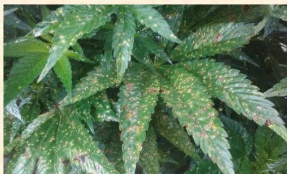
Bipolaris leaf spot