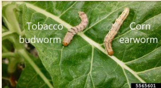
Tobacco Budworm and Corn Earworm Larvae