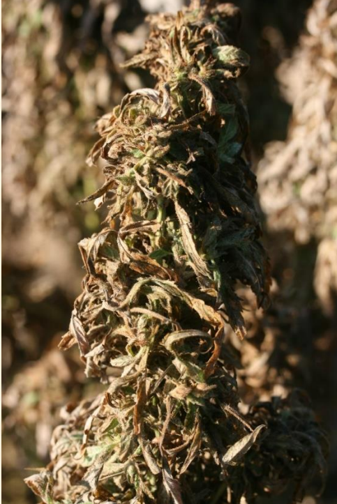
Fusarium bud blight, Photo by William Bamka

Fusarium bud blight occurs in female flower buds and grains and infection may result in contamination by Fusarium mycotoxins. There is much concern over this potential for contamination and work is ongoing to understand differences in varietal susceptibility.