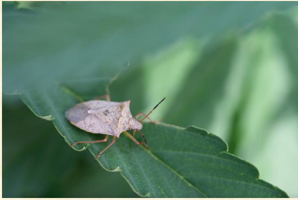
Stink bug on hemp leaf