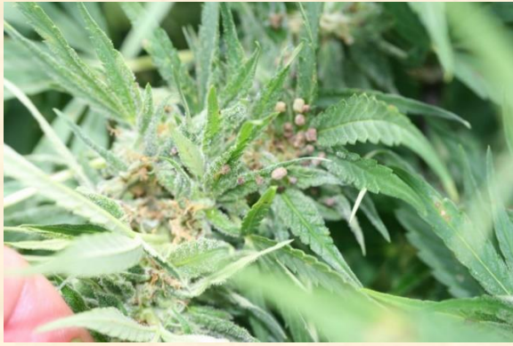
Frass (excrement) from corn earworm