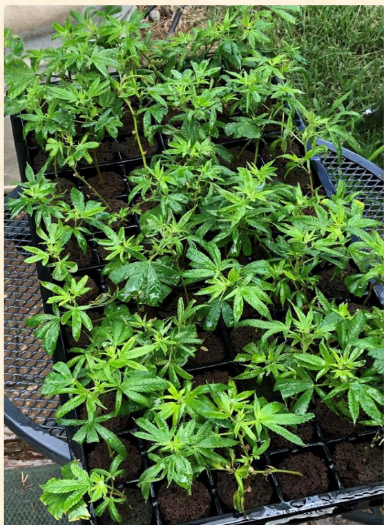
Hemp plants being prepared for transplanting