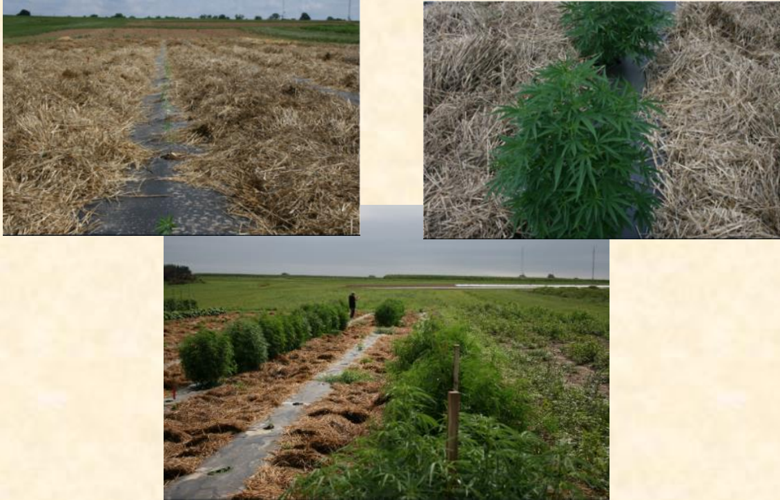
Straw mulch between rows for weed control, Photos by William Bamka and Stephen Komar

Prevent the arrival of new weed species by ensuring the use of weed free seeds or transplants and cleaning equipment prior to entering the field. Using both plastic mulch for in-row weed control and organic mulches, like straw, to prevent weeds between rows is recommended for hemp grown for CBD production.