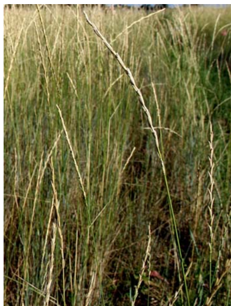
INTERMEDIATE WHEATGRASS, A PERENNIAL GRAIN, BEFORE HARVEST