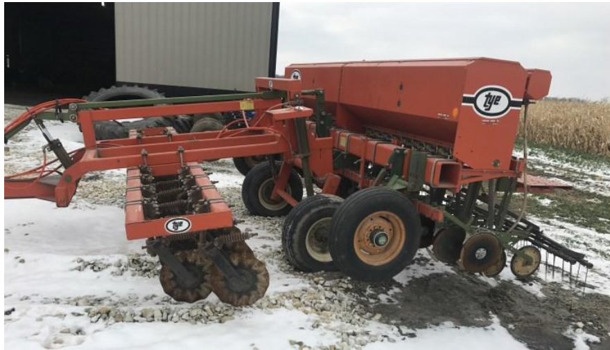
No-Till 15' Tye Drill for Modification. Note Front No-Till Coulter Bracket for Holding Precision Planter Units to accomplish Dual Planting – Interseeding Objective