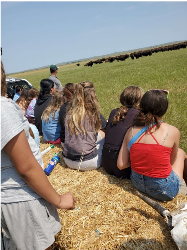
Field trip to the Cheyenne River Buffalo Ranch