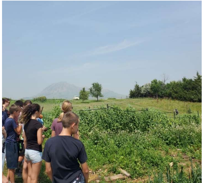
Youth at Bear Butte Gardens