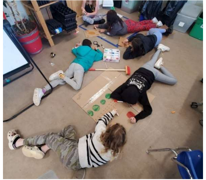
Middle school students constructing their dream square foot garden