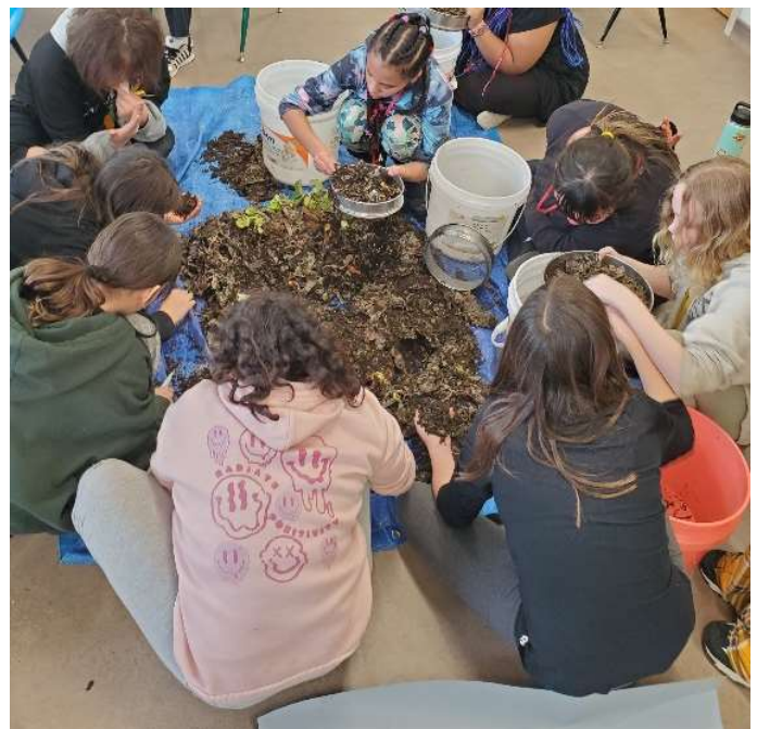
Youth harvesting worm castings from the vermicomposting unit