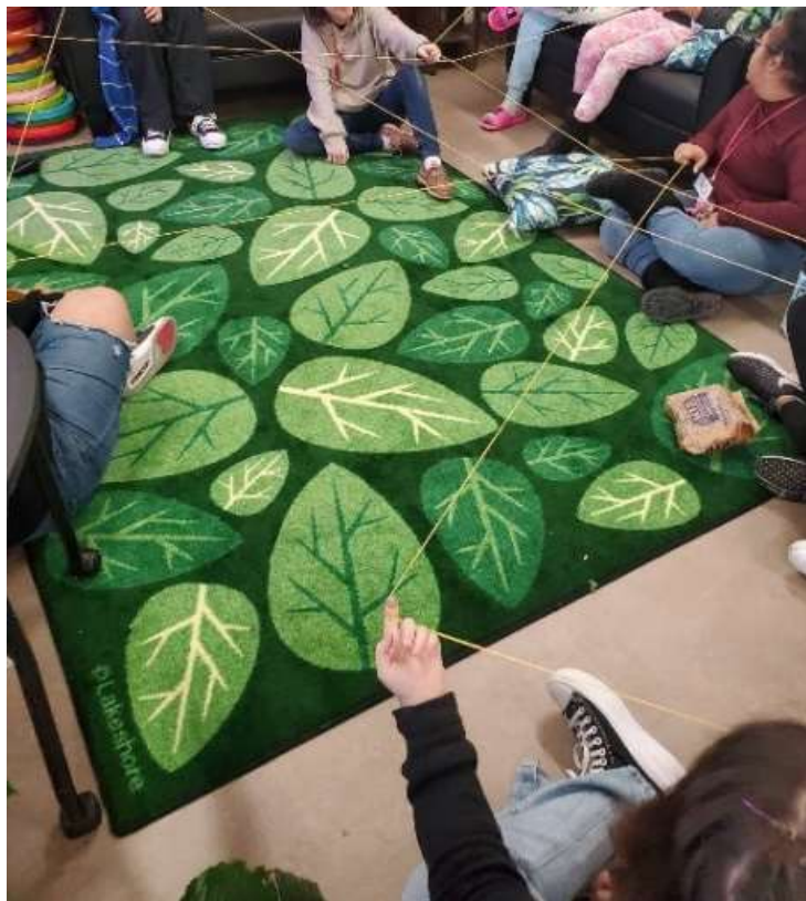
Systems thinking activity