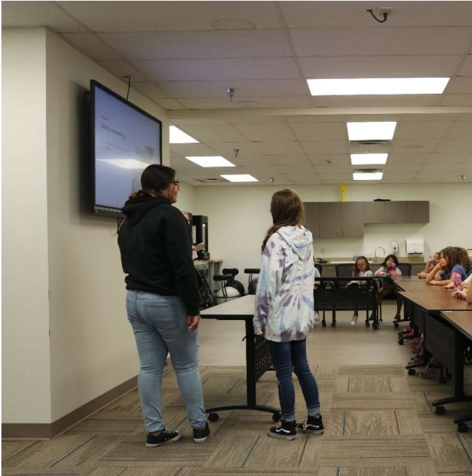
Middle school youth presenting their composing project