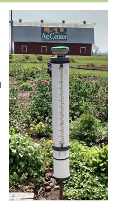
Figure 2. Example of an atmometer.

The atmometer is a waterfilled tube measuring 3-4 inches in diameter and 12 inches tall (Fig. 2). The top of the tube is covered in a green fabric that simulates ET<sub>o</sub> from a reference plant leaf. A clear tube with inverted markings indicate the water level within the opaque main tube. The water level aligns with zero when the tube is full. As the water level drops due to evaporation through the green fabric, a cumulative estimate of water loss is visualized using the depth markings. A movable red ring around the small, clear tube can be used as a trigger threshold for irrigation.