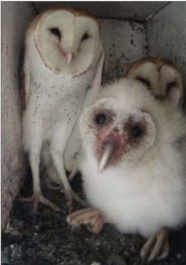
Adult and juvenile barn owls in a nesting box.

Deciding How Many to Install – Barn owls are not territorial, so boxes can be spaced as close as every 150 feet or as distant as one per field. More is better, so let your willingness to invest in them and ability to maintain them be your guide. And don't worry if some of the boxes you install don't look like they're being used. Even boxes that aren't holding nesting chicks are often used by adults looking for a few hours of quiet time away from the screeching kids.