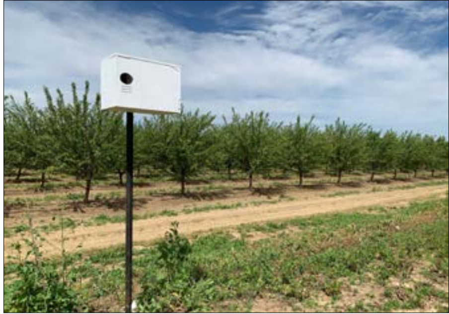
A barn owl box in an orchard.