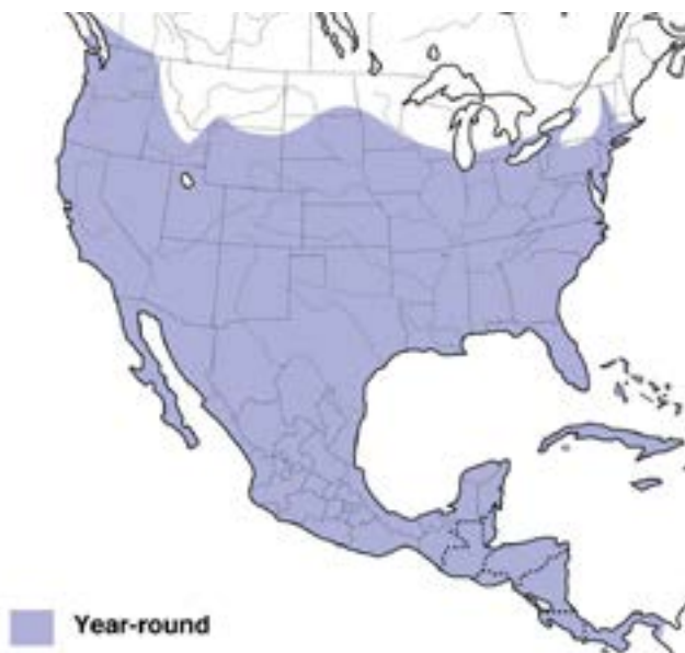
Barn owl habitat.

How to Know if They're Working – Once installed, owls may take up residence right away or it could take a few seasons. Two easy ways to tell if owls are nesting in a box are to look for bones and owl pellets on the ground beneath it, or blood and gut stains on the box itself. (Biocontrol isn't pretty, after all...) Also expect some variability year to year as owl populations fluctuate.