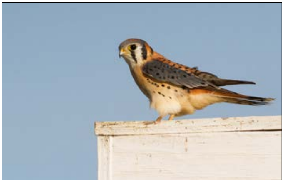
Day-hunters like hawks and kestrels will also perch on owl boxes.

For even better rodent control, also install raptor perches when you install barn owl boxes. Mount a wooden cross brace to a 10- to 15-foot high pole. Hawks and kestrels will use them while hunting during the day, and barn owls use them at night.