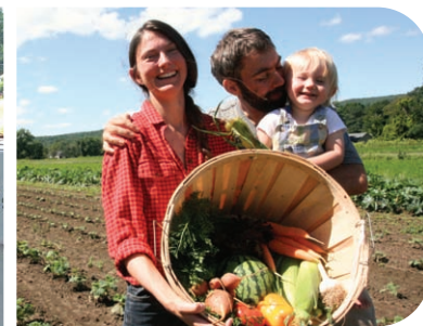
Chamutka Farm and Red Fire Farm are two of the six primary farms from which Real Pickles sources vegetables, herbs, and spices.

describing the offering in detail, in addition to filing a variety of other documents. Once submitted to the regulators, Rosenberg worked closely with Cutting Edge Capital to prepare responses to the regulators’ successive rounds of questions. While they were initially told that the approval process would take just a month, in the end it took five. The regulators asked many questions to understand how the value of Real Pickles was determined, and to make sure that the sale was fair. A primary duty of securities regulators is to protect investors, so a lot of back and forth ensued about highlighting the investment’s risk factors, and making sure the benefits and risks were balanced in presentation and advertising. A few significant changes also emerged from working with the regulators. First, in an effort to protect community investors, the regulators wanted individual investments to be limited to 10% of the investor’s liquid net worth. Secondly, Real Pickles reduced the offering from $550,000 to $500,000 in order to avoid a requirement for audited financial statements, a step that would have significantly added to their costs. Ultimately, they ended up filling the $50,000 gap with a subordinated loan from the Cooperative Fund of New England. “Although working with the regulators took a lot of time,” reflects Holland, “It made for a stronger prospectus. In the end, we came out knowing our prospectus very well, and able to answer almost any question that came up.”