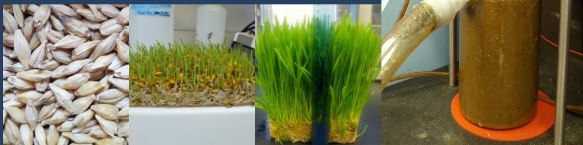
Left to right: barley grain, barley after 3 days of sprouting, barley after 7 days of sprouting, continuous culture fermentation unit with rumen fluid used to determine digestibility and methane output of diets.

Our objective was to evaluate the nutritional composition, digestibility, and methane output of sprouted barley grain incubated in a continuous culture fermentation system.