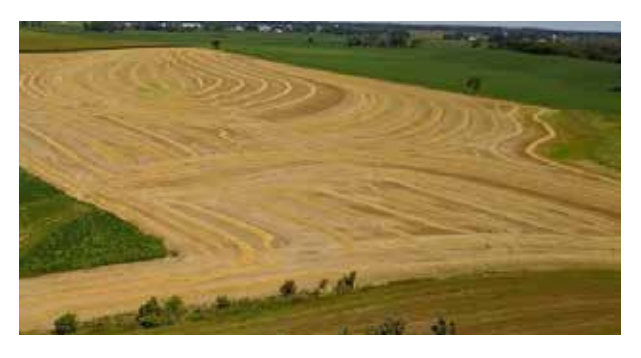
Layout of prairie strips is visible as mowed paths through soybeans and recently harvested winter wheat. Newly emerging prairie vegetation is not yet visible beneath wheat stubble.

Concurrent with determining a layout for the prairie strips, Charlie and Bill re-designed the planting pattern on this field to follow the contour and align with the orientation of the strips to the extent practical. The farm utilizes precision technology to turn off the planting and application equipment when necessary to cross the prairie strips.