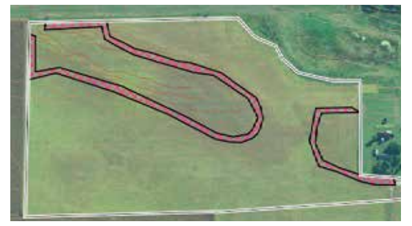
Field with two prairie strips on contour and additional strips on headlands.