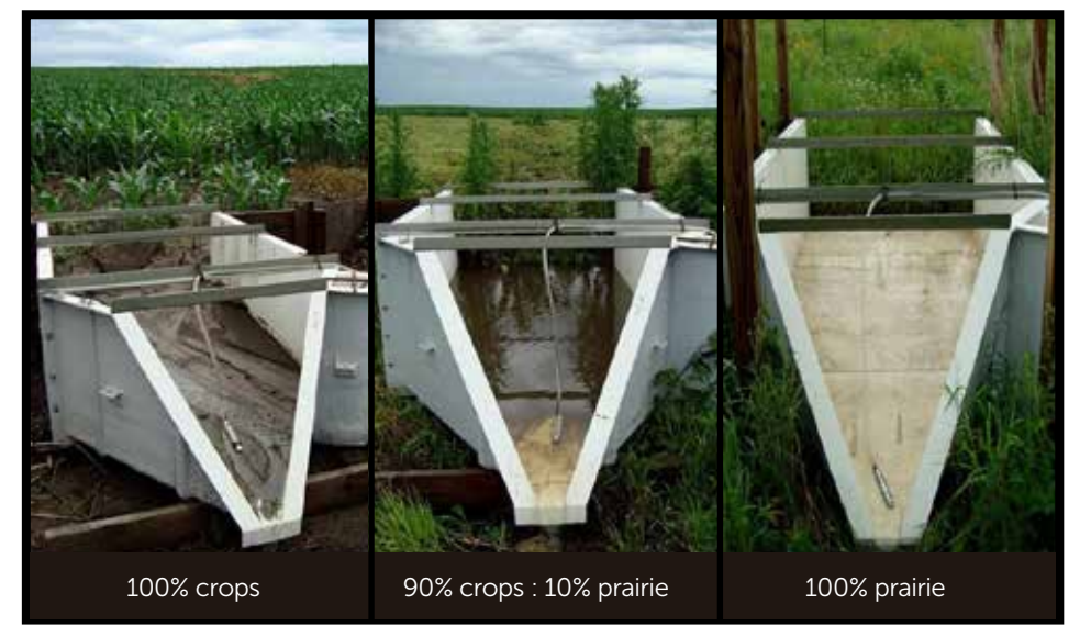
Figure 2: H-flumes comparing runoff between two STRIPS catchments (photo 1 and 2), and a nearby catchment in 100% prairie cover (photo 3). Photo: Iowa State University STRIPS

Figure 1: Layout of six of the 12 prairie strips catchments in the Iowa State University STRIPS research trials. Photo: Iowa State University STRIPS