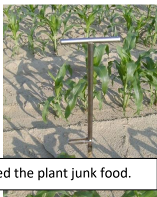
Conventional farming kills the soil and the feed the plant junk food.

The dominant view is that soil is just a medium that holds plants in place and synthetic nutrients must be applied - is not sustainable. Synthetic nitrogen leaching is not good, but it is unavoidable as farms try to maximize nitrogen fertilizers for highest yield. Conversely, sac-body, gummy-worm- nitrogen does not leach. It is slow release. Salty synthetic fertilizers make a hostile habitat for soil livestock. If we could see sick soil, like we can see a sick cow....we would be aghast at the devastation we've caused.