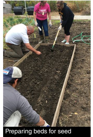
Preparing beds for seed