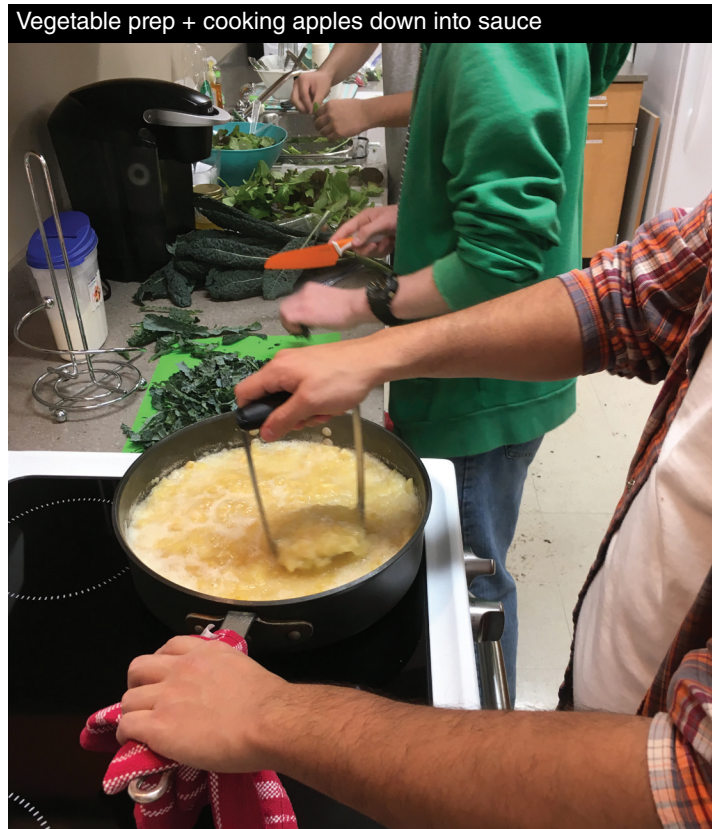
Vegetable prep + cooking apples down into sauce