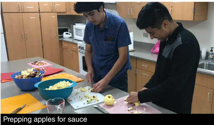
Prepping apples for sauce