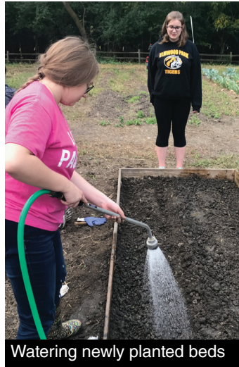
Watering newly planted beds