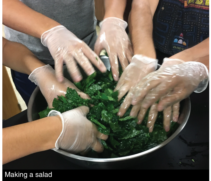
Making a salad