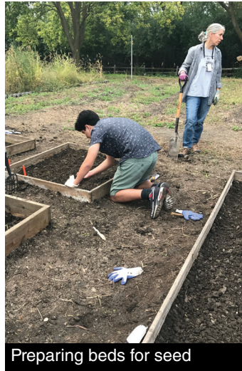
Preparing beds for seed