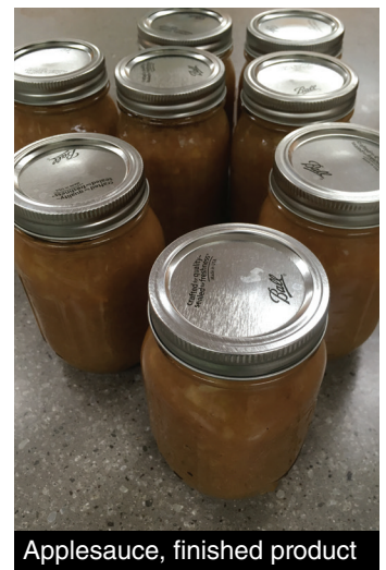
Applesauce, finished product