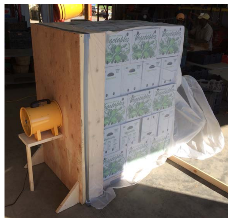
The blower is just placed up to the cut-out hole, on a shelf. This unit has a very simple shelf and feet to add some stability.