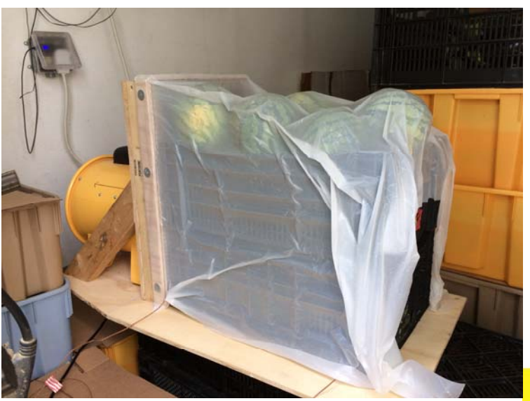
123 lbs of Watermelons will take a long time to cool, but forced air cooling removed field heat 2 times faster than ambient room cooling.

Attempts have been made at smaller scale pre-coolers to reduce field heat at harvest in absence of coolers (Thompson and Spinoglio 1996). Retrofitting a cargo container with insulation and cooling with a large capacity air conditioner