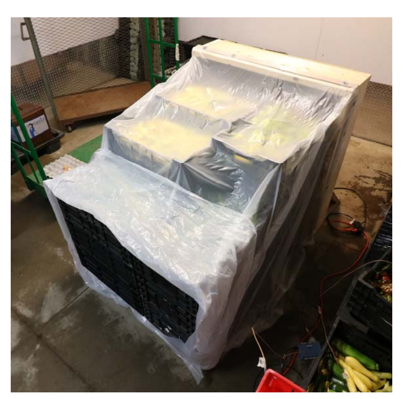
This is a 4 foot tall version of a simple, portable forced air cooler. It is being used to cool a mixed pallet of fresh picked zucchini, summer squash, and peppers.

was also explored (Boyette & Rohrbach 1990). This forced-air cold room offered space for many pallets of produce but it still took many hours to reduce the temperature internally, especially for the boxes on pallets in the center of the container. The key is integrating both cooling and air flow effectively (see Figures 1 & 2).