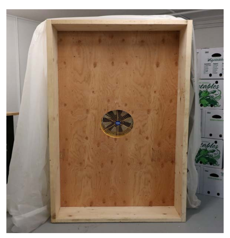
This Pallet sized Forced Air Cooler was easily constructed in an afternoon with decking screws, dimensional lumber and plastic sheeting.

12" Portable Ventilation Blower. This blower can be purchased through Global International (Item#T9F246343) and other suppliers. It can be run at two speeds with flows of 1600 or 1400 CFM (at approximately 0.5 IWC). Smaller (8") and larger (16")diameter blowers are available for different sized coolers.