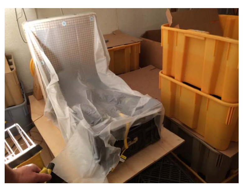
25lbs of eggplant cooled by 23°F in 30 minutes, while "room cooling" only dropped 8°F in the same amount of time.

The blower used was the same 12" blower from Global International. A 11 1/4" hole was cut out of the plenum to provide the suction air inlet to the blower.