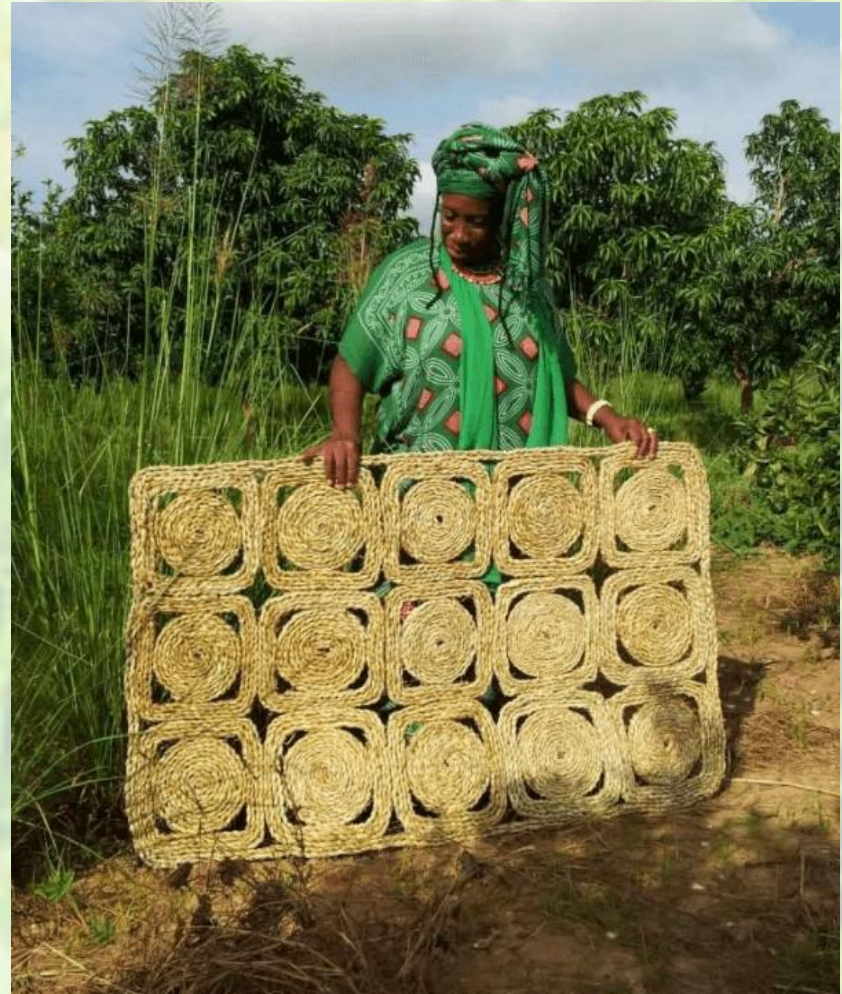
Vetiver Network International