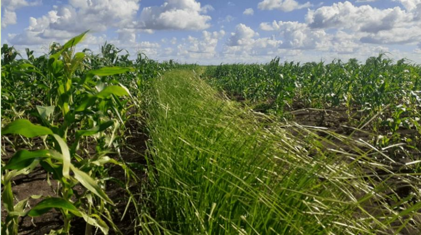
Vetiver Network International