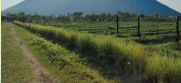
Vetiver Network International