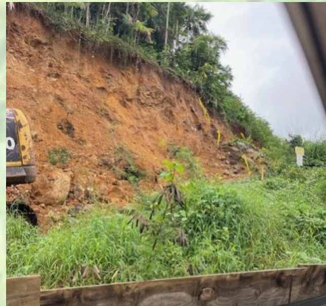
Nov 2024 Recent rains on St Thomas