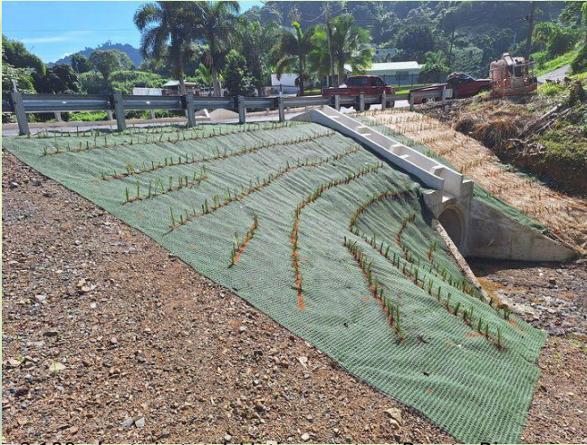
2,100 plants in total. Vetiver system Puerto Rico. Samuel Hernandez