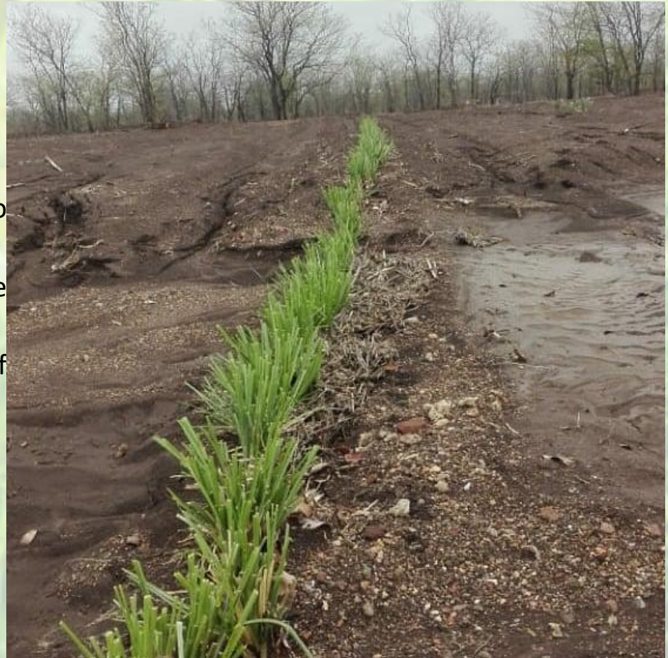
Vetiver Network International