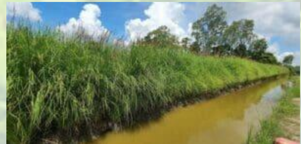
Vetiver Network International