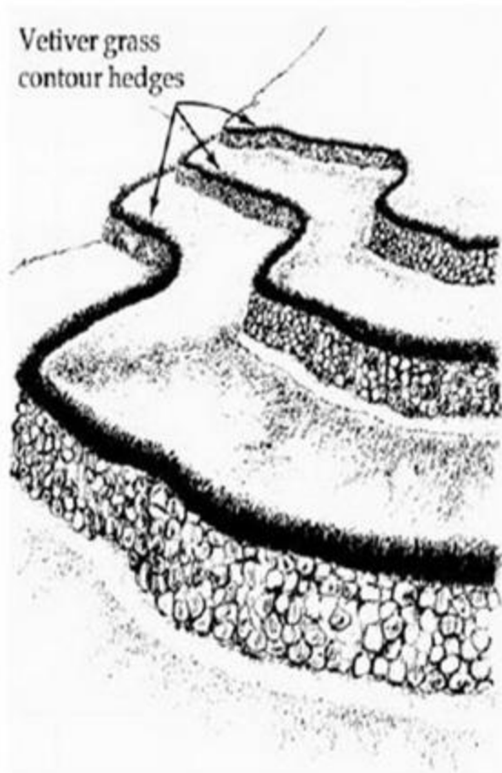
Figure 7-31d. The vetiver root system stabilizes the entire rock face of the vulnerable masonry risers.

Figure 7-31c. Vetiver grass, planted on the extreme edge of each terrace, stabilizes the terraces without interfering with the essential drainage between the stones.