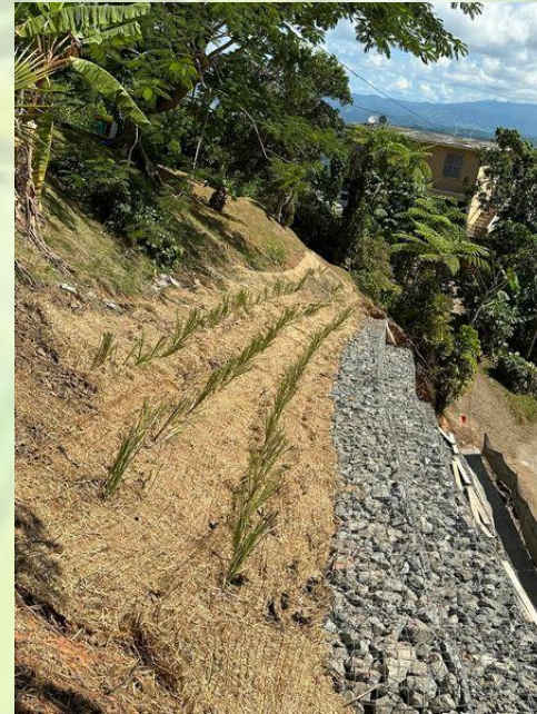
Bioseed Puerto Rico Inc