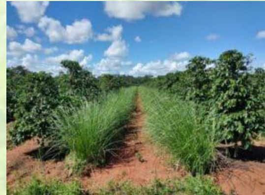
Vetiver Network International