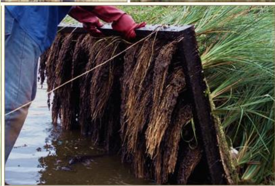
Vetiver Network International