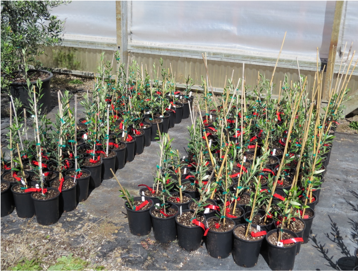
Olive cultivars for cold hardiness evaluation after potting into 1-gallon containers, September 2020.