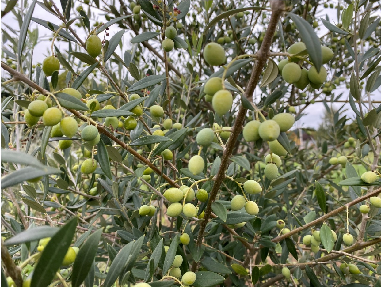
Fruit set on 'Mixan' in the olive stock block, October 2020.