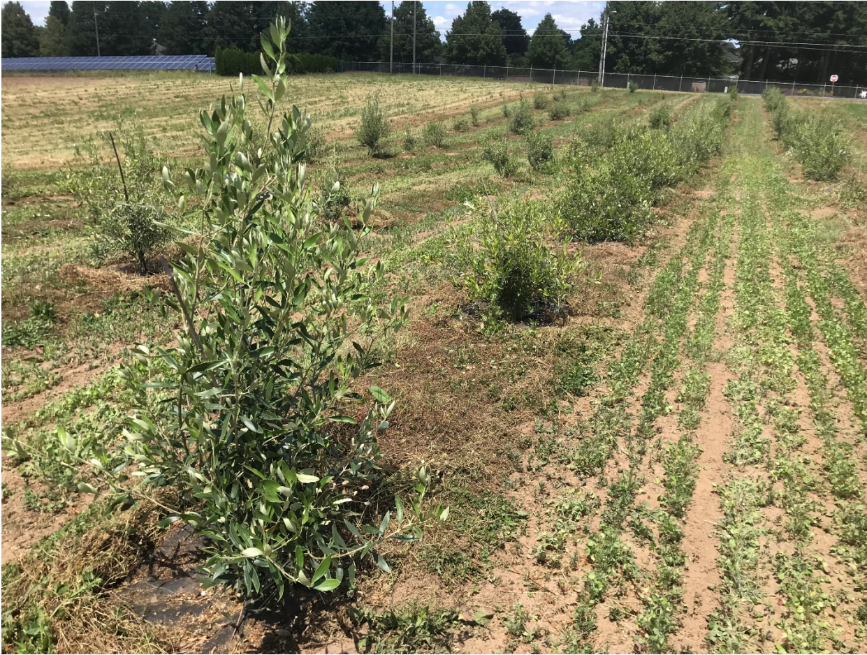
Olive stock block at North Willamette Research and Extension Center, July 2020.