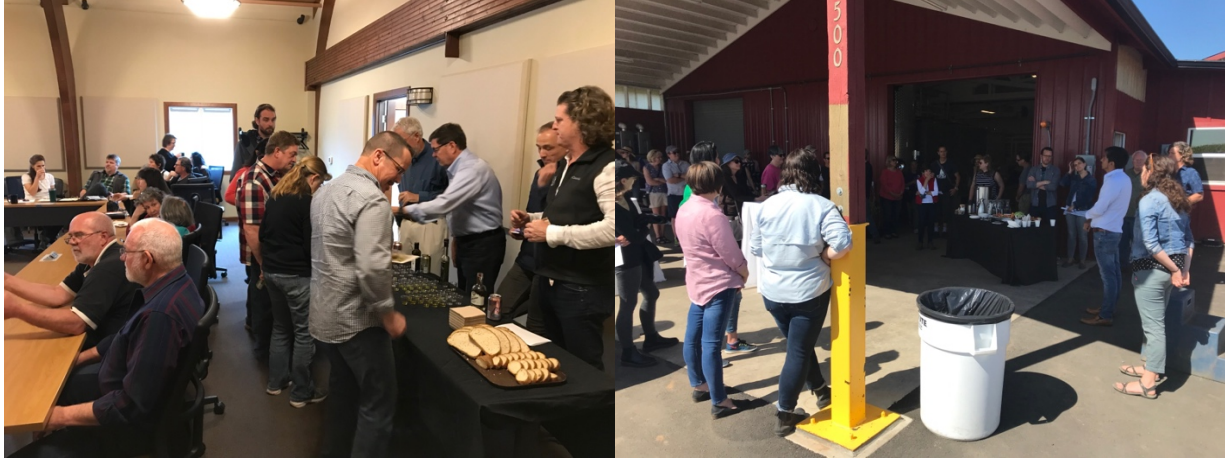
2019 Olive Advisory Council and Grower Meeting (left); Olive Field Day at Red Ridge Farms/Durant 2019 (right).