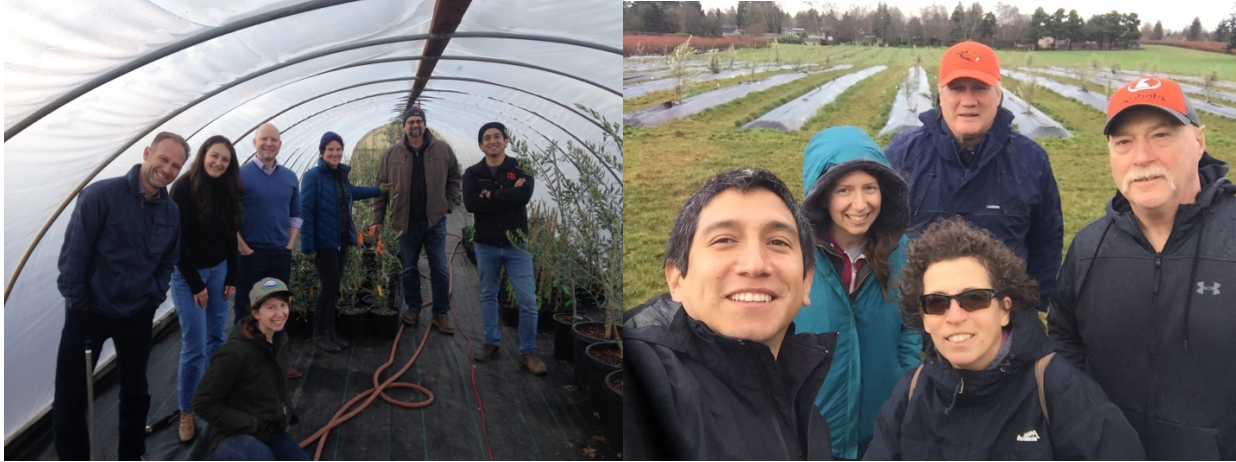
Grower visits and project tours at NWREC, 2019.