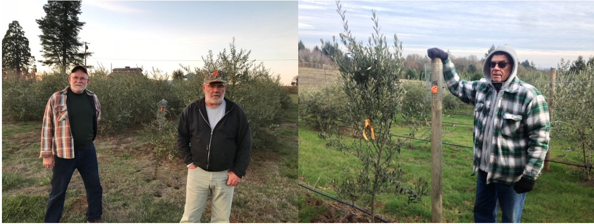
Growers posing with the temperature sensors installed in their fields, 2018.