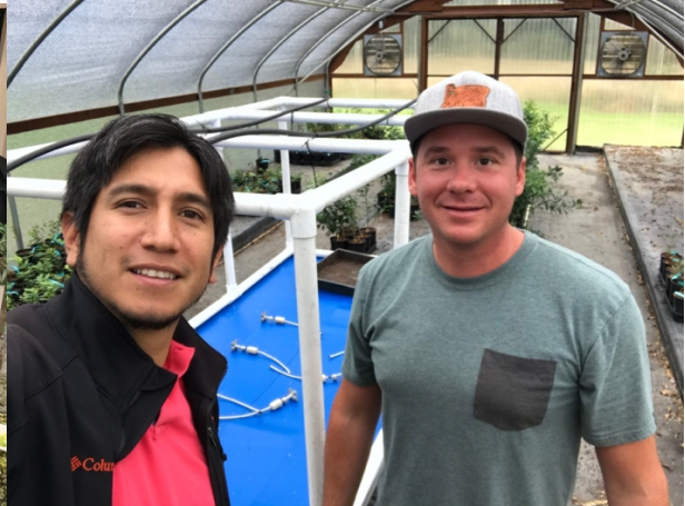
Olea Project and Olive Grower Tasting Booth at the Culinary Breeding Network Variety Showcase in early 2020 (left); installing a mist bench at an additional propagation study collaborator site, 2020 (right).