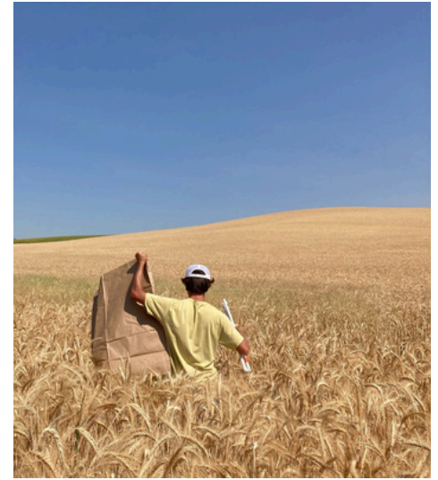
A researcher hand-harvests grain to compare yield, quality, and nutrient content between test and control plots.

In the fields involved in this study, plant sap analysis provided a valuable snapshot of current nutrient conditions. One farmer reported that sap testing helped identify nutrient deficiencies in their crops, while another used it to analyze weeds and better understand which nutrients were being taken up across the field. Preliminary results also suggest that sap testing in Inland Northwest grain systems may reduce fertilizer costs without negatively affecting yield, offering both economic benefits and potential environmental improvements.