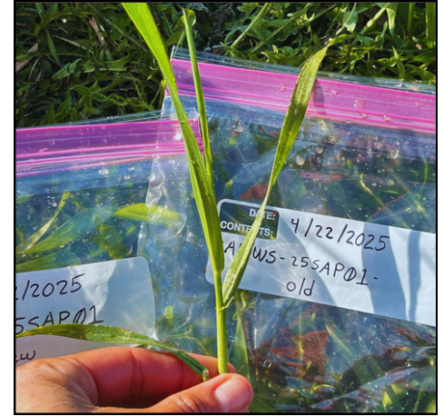
Collecting old and new leaves for sap analysis in winter triticale

Palouse Conservation District partnered with three Whitman County producers to compare grain yield and quality between fields treated with foliar fertilizer guided by periodic sap analysis and those managed with traditional fertilization methods. Foliar application involves spraying fertilizer directly onto plant leaves, allowing the plant to absorb nutrients through the leaf surface. We also tracked costs and overall feasibility to better understand how sap analysis might fit into day-to-day farm operations. Samples were collected during the 2023 - 2025 growing seasons.