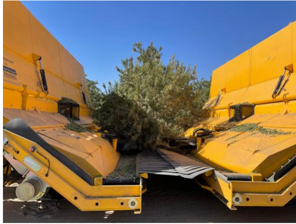
Catch frame harvest equipment.