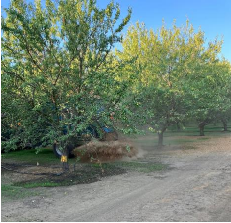
Hull and shell application Fall 2022.