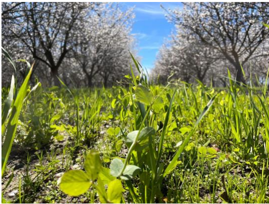
Pea, oat, mustard cover crop mix in February 2023.