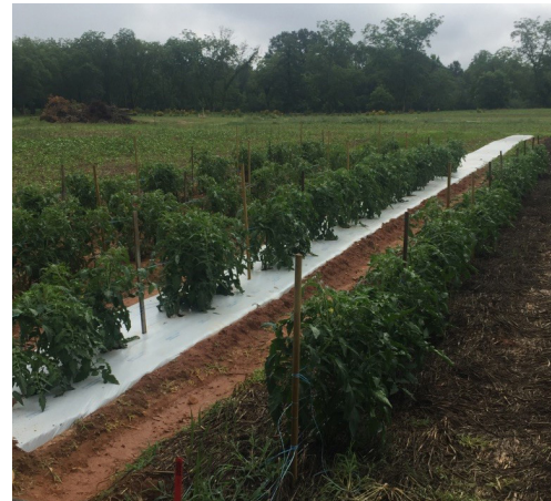
Conventional and no-till tomato plots

During the 2016-17 winter, we established a cover crop of black-seeded oats and crimson clover. From this cover crop, we pulled samples, which were analyzed by the University of Georgia Soil Test Laboratory. Their analysis suggested a 50 lbs./acre nitrogen credit. We used this information to develop treatments for a demonstration experiment. Treatments included conventional staked tomato production with plastic mulch and 150 lbs./acre nitrogen, bare ground with incorporated cover crop using 100 or 150 lbs./acre nitrogen, and killed and rolled cover crop using 100 or 150 lbs./acre nitrogen (Figure 3).