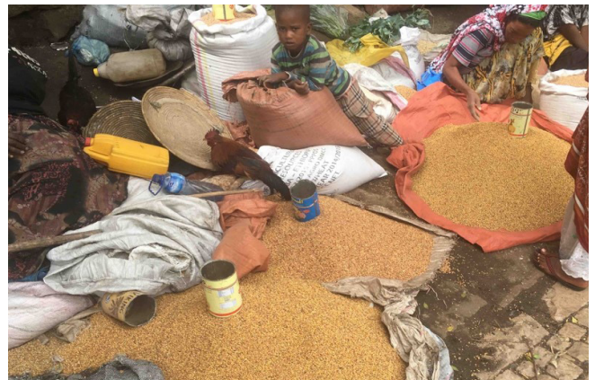
Sorghum being sold in the city of Harar, a UNESCO World Heritage Site in Ethiopia.

One of these nascent crops is a perennial version of sorghum ( Sorghum bicolor ) jointly being developed by The Land Institute in Salina, Kansas and UGA's Feed the Future Climate-Resilient Sorghum Innovation Lab. Sorghum's ability to survive extended periods of drought and regrow after harvest from the remaining root and crown portion of the plant for successive harvests—a practice known as ratooning—contributes to its importance as a traditional food crop in many arid and food insecure regions of Africa. Agricultural experts are questioning whether perennial sorghum and other new perennial crops could enhance the food security and livelihoods of smallholder subsistence farmers through extended growing seasons, multiple harvests, labor savings, and efficient use of other costly and difficult to obtain inputs.