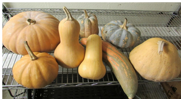
Examples of winter squash cultivars planted in year three. Front, left to right: Seminole, South Anna, Waltham butternut, Candy Roaster, and Mrs. Amerson's. Back, left to right: Tan Cheese, two Chinese Tropical Pumpkins showing variation in shape. All cultivars are Cucurbita moschata except 'Candy Roaster' which is C. maxima.

Winter squash are the mature fruit of the species Cucurbita moschata , C. maxima , and C. pepo . Cucurbita pepo performs best in cooler and/or drier climates and includes traditional pumpkins, delicata , and acorn squashes as well as the summer squashes. Hubbards and 'North Georgia Candy Roaster' are C. maxima varieties and are not highly disease resistant. Many of the C. moschata varieties are of sub-tropical or tropical origin, and are often better adapted to southeastern conditions. The exception is the popular butternut varieties such as 'Waltham'. Butternuts were developed in the north and are highly susceptible to diseases such as downy mildew. Other C. moschata cultivars tested included 'Seminole', 'Tan Cheese', 'Mrs. Amerson's', 'Chinese Tropical Pumpkin', 'Thai Kang Kob' and the recently developed 'South Anna Butternut' from Commonwealth Seeds in Virginia. 'South Anna' is a cross of 'Waltham' butternut and the disease resistant 'Seminole'. After several years of selection, the 'South Anna' has the shape and flavor of a butternut but the disease resistance of a 'Seminole'.