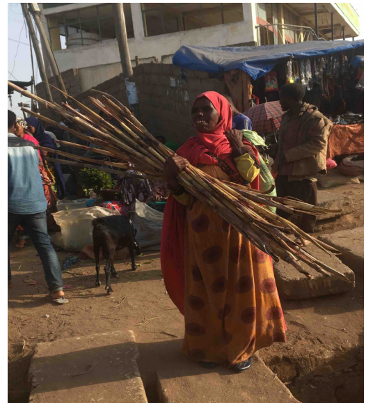
A woman carrying home sorghum stalks to be used as cooking fuel. Many areas of Ethiopia suffer from deforestation and sorghum stalks are an important fuel source in these areas.