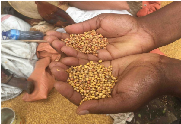
A market vendor showing some of the variation of sorghum sold in the marketplace of Harar, Ethiopia.

Sorghum has been part of people's lives in this region for millennia. All parts of the sorghum plant were used for food, fuel, fodder, and fabrication material. Farmers described using numerous locally adapted sorghum varieties with different growing season lengths and ratooning abilities to maximize harvest under what they said were increasingly erratic rainfall patterns. Farmers explained that sorghum ratooning was only successful under sufficient rainfall. In years when farmers anticipated insufficient rainfall, short-season varieties were preferentially planted to obtain grain sooner and forgo ratooning.