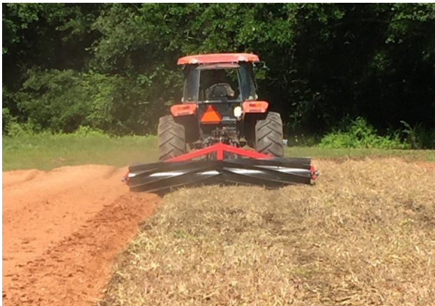
A roller-crimper preparing no-till beds

In 2017, the Chestatee/Chattahoochee Resource Conservation and Development Council purchased a no-till transplanter and roller crimper which they hoped to lend out to growers wishing to adopt no-till practices. We at the University were tasked with demonstrating the use of this equipment for vegetable production.