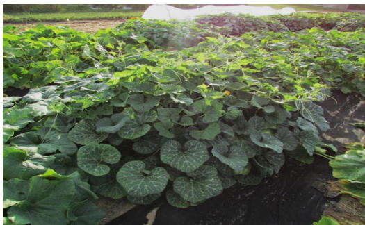
Downy Mildew defoliating a (A) susceptible ‘Waltham Butternut’ and a healthy (B) resistant ‘Chinese Tropical Pumpkin’ in the second trial.