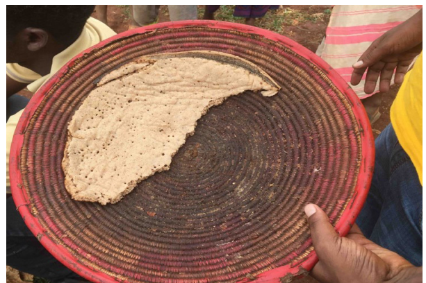
Sorghum "Inerja" (pictured here) is a flatbread consumed with every meal. Inerja can be prepared with teff, sorghum, or a mixture of the two grains.

Interviewed farmers adjusted their strategies from season to season in an improvisational manner, suggesting that in this specific context, enhanced ratooning sorghum may confer greater benefit than a truly perennial sorghum. A true perennial could limit the ability of farmers to improvisationally adapt farming systems to environmental conditions. Developing perennial sorghum is still an important goal, and the extensive sorghum knowledge and genetic diversity developed by farmers indicate that they can greatly contribute to the efforts to develop perennial sorghum and its cropping systems. The farmers I interviewed graciously shared their knowledge with me, however use of this knowledge