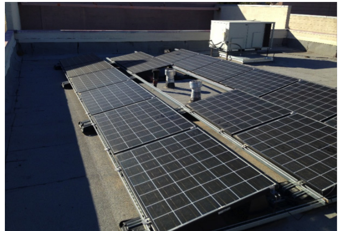
Figure 9. An array mounted on a flat roof of a commercial facility. Shade from a nearby wall is cast upon a portion of the array.