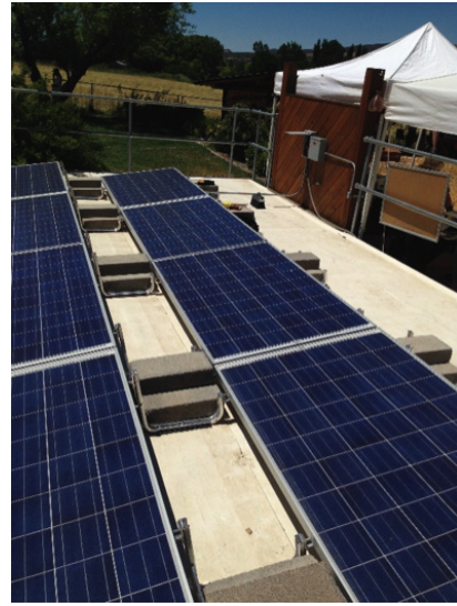
Figure 8. Ballast mounting systems rest on the surface of the roof and are held in place with cinder blocks. Modules are clamped to the aluminum frame at an angle of 10 degrees.

resulting in lower cell temperatures and higher performance (Hren, 2010). Ground-mount systems are safer to install because the work is done on the ground. There is no need for climbing or safety roping. This method provides easy access to the array for maintenance. The disadvantages to this method include: the amount of time needed for installation; the space required for the system; dealing with uneven ground or unstable soil-type, and keeping the surface area below and around the array free from growing brush. Accessibility to the system by humans and animals may need to be controlled to prevent damage to cables and access to system controls. Increased theft, or vandalism may be an issue and require a security fence or enclosure. In high elevations where snow is an issue, the system needs to be designed to allow for easy snow removal. A system consisting of multiple rows of modules needs to be spaced so shadowing from one row does not interfere with the next row behind it. A decision on the maintenance of the ground area below and around the ground-mount array needs to take into account the time and expense for weed and brush control. A ground cover such as gravel can be used for drainage, minimize erosion, and can eliminate (or reduce) the need for vegetation control, but is an added expense.