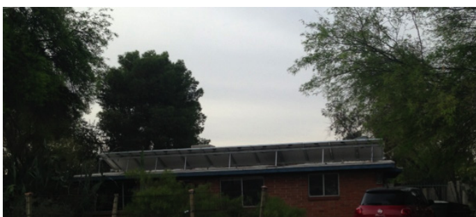
Figure 4. Tilt-up mounting systems on low slope or flat roofs are a method to set the tilt of the array to the latitude of the location to maximize the energy output of the array. Although this system is facing south, shading cast on modules from nearby trees can limit the amount of energy an array is capable of producing.

into consideration snow load and removal. Consulting with a roofing company to determine how a roofing material warranty might be affected is advisable.