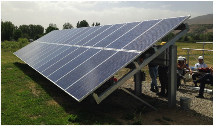
Figure 7. Solar modules arranged in two rows on a large fixed-plate ground mount system. The larger size modules require larger mounting materials to support the weight and to keep the system stable during high wind winds and at a tilt angle to allow snow loads to be easily removed.

resulting in lower cell temperatures and higher performance (Hren, 2010). Ground-mount systems are safer to install because the work is done on the ground. There is no need for climbing or safety roping. This method provides easy access to the array for maintenance. The disadvantages to this method include: the amount of time needed for installation; the space required for the system; dealing with uneven ground or unstable soil-type, and keeping the surface area below and around the array free from growing brush. Accessibility to the system by humans and animals may need to be controlled to prevent damage to cables and access to system controls. Increased theft, or vandalism may be an issue and require a security fence or enclosure. In high elevations where snow is an issue, the system needs to be designed to allow for easy snow removal. A system consisting of multiple rows of modules needs to be spaced so shadowing from one row does not interfere with the next row behind it. A decision on the maintenance of the ground area below and around the ground-mount array needs to take into account the time and expense for weed and brush control. A ground cover such as gravel can be used for drainage, minimize erosion, and can eliminate (or reduce) the need for vegetation control, but is an added expense.