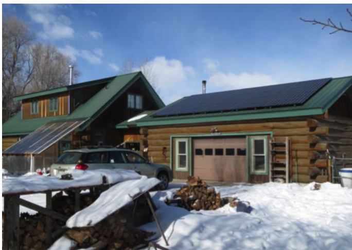
Figure 3. In a higher elevation, the array needs to be mounted so snow is not piling up on the edges of the modules.