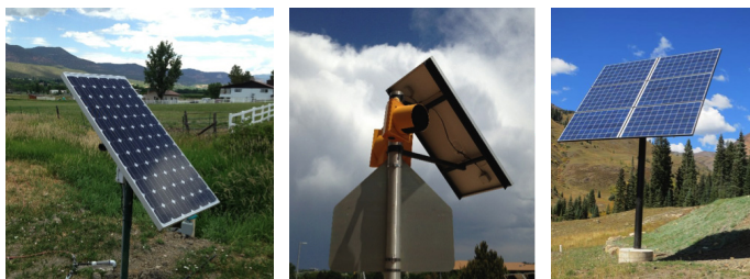
Figure 5. Modules or array affixed to a rack and mounted on the top of or to the side of a pole. The pole-mount can be oriented in a specific direction. The amount of excavation depends on the size of the array.

System installation design of the roof-mount system must adhere to local fire codes. This includes a recommended set back of the array from all edges of the roof to allow access by