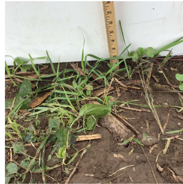
HM 3-14 days post plant