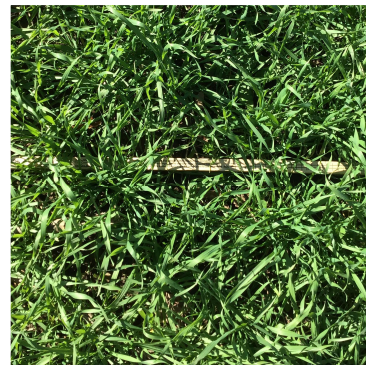
W. Triangle DM est. 50 days post plant