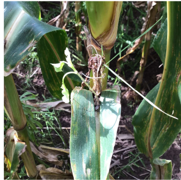
sprouted rye & radish HM 5