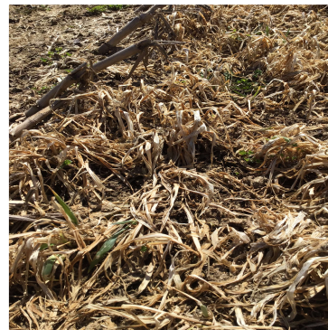
Close up winterkilled black oats