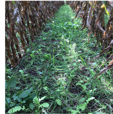
HM 1-42 days post plant