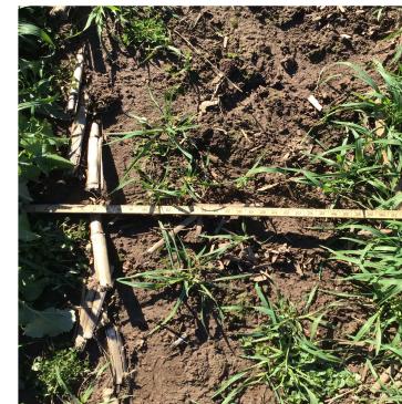
Harvest track width