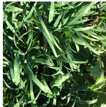
HM3 DM estimation 2 mo. post plant