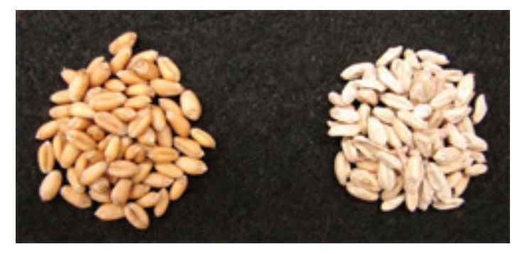
Figure 3. Healthy kernels (left) and shriveled, bleached FHB diseased kernels (right)