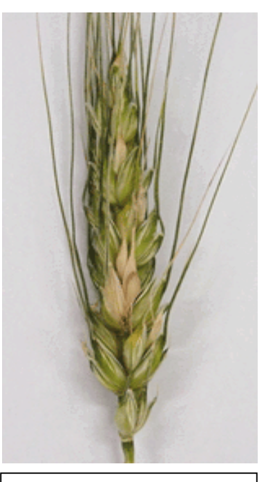
Figure 1. Bleached spikelets within the grain head

Severity of infestation is best determined in the field through two metrics: incidence and intensity. Disease incidence is determined by counting the percentage of heads out of a hundred with any infestation in a random sample taken throughout a field. Intensity is determined by calculating an average percentage of spikelets infected