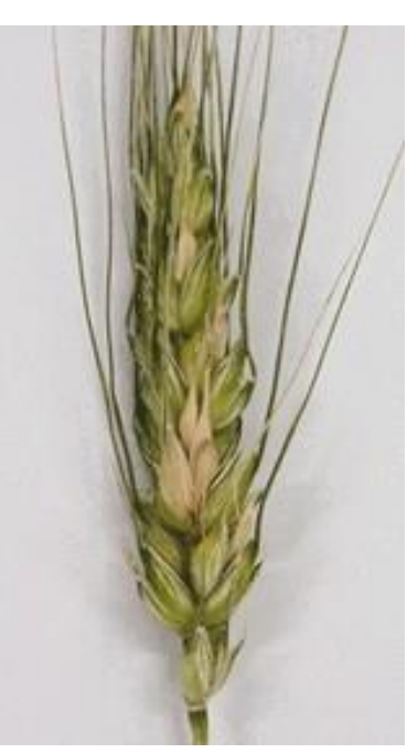
Figure 1. Bleached spikelets within the grain head

Severity of infestation is best determined in the field through two metrics: incidence and intensity. Disease incidence is determined by counting the percentage of heads out of a hundred with any infestation in a random sample taken throughout a field. Intensity is determined by calculating an average percentage of spikelets infected