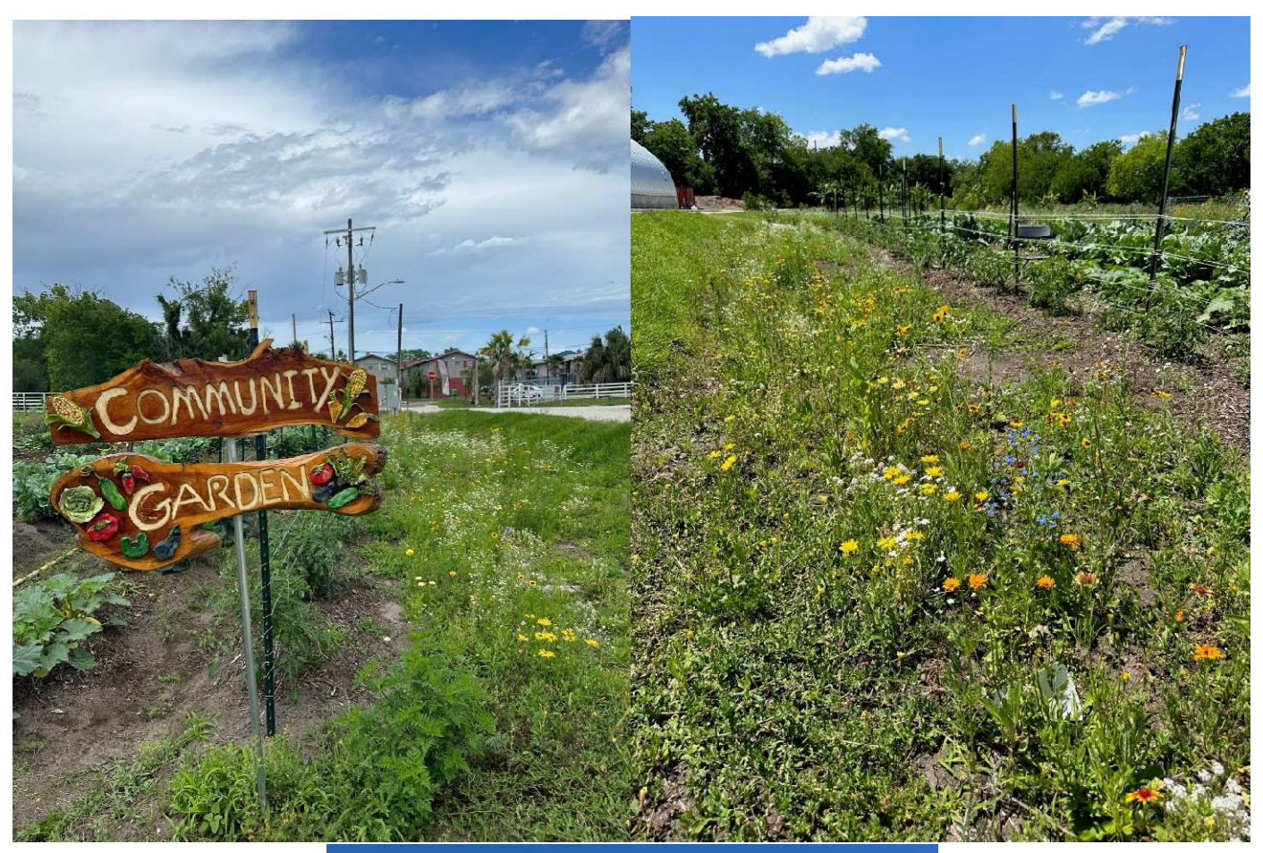
Pollinator crop area is newly established in January of 2023, it is planted next to the WHF community garden.