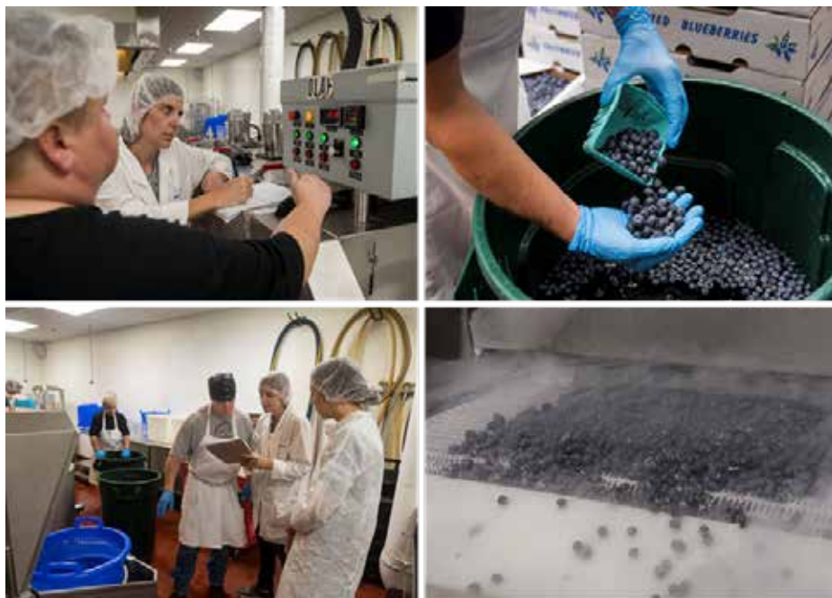
Research and development at the Greenfield Food Processing Facility for blueberries.

To answer these questions, the team secured funding through the NE-SARE