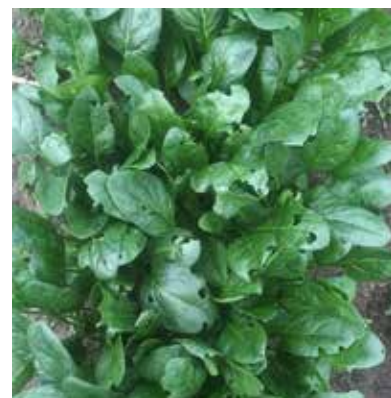
Caterpillar feeding damage in high tunnel spinach.