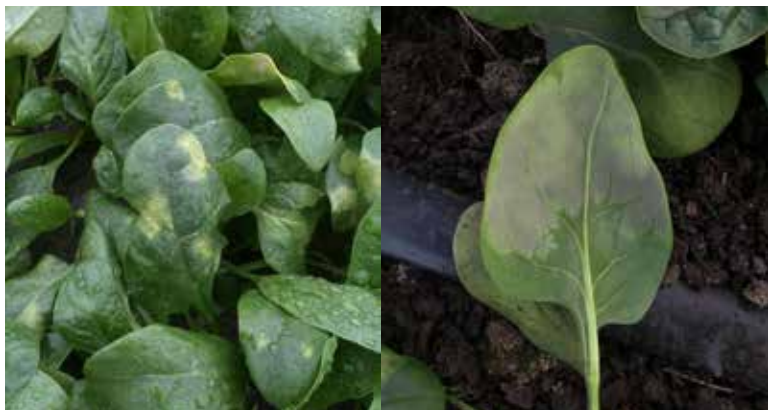
Spinach downy mildew causes yellowing on the upper side of the leaf (left) and fuzzy gray sporulation on the underside of the leaf (right).

Brassica powdery mildew was identified on broccoli, kale, and rutabaga on two farms in Hampshire Co. in October. In broccoli, symptoms began as gray-black lesions on petioles with white to gray sporulation present. The disease spread to a nearby kale crop causing similar damage on petioles and leaves. In rutabaga, the disease was not damaging to the harvested crop, but was present on leaves. Powdery mildews are host-specific, meaning that brassica powdery mildew is a different organism than the powdery mildews of cucurbits, tomatoes, lettuce, and other crops. Of the brassica crops, kale is most susceptible to powdery mildew. Most products labeled for Alternaria leaf spot on brassicas are also labeled for brassica powdery mildew; see the brassica disease section of the New England Vegetable Management Guide.