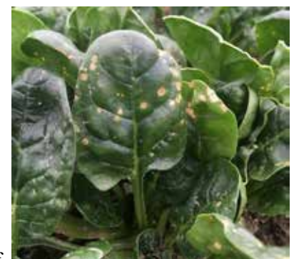
Cladosporium leaf spot on spinach.

Cladosporium leaf spot was reported in late-October on 'Kolibri' spinach in Hampshire Co., MA. Since then we have heard several additional reports from around the region. This fungal disease has been reported in field and high tunnel spinach in the past several years but is not well studied. Leaf spots begin as tan and then develop olive green sporulation. Susceptibility varies by variety but no commercial-level resistance has been identified. Disease development is favored by high humidity and cool temperatures (below 70°F). Cladosporium can be seed-borne and can survive on crop residues in soil, but it's not well understood how important either of these routes are in the disease cycle. Once plants are infected, spores are spread by