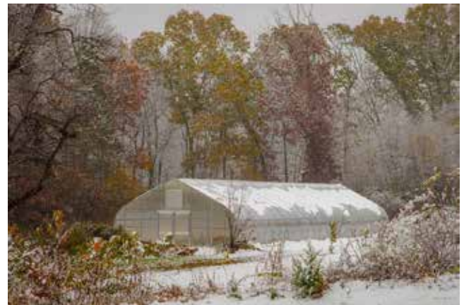
A high tunnel, nestled in a cold spot on a farm, with snow clinging to the plastic.

Light is the most limiting factor. If you want plant growth in the winter, you'll have to be understanding of the fact that light is the most limiting factor. Unless you supplement with artificial light, you can't change that unless you move to a much lower latitude. So it may help to adjust your expectations by knowing when your plants really won't grow much, and when they will.