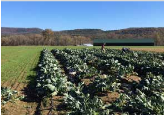
We wrapped up our field trial season a few weeks ago by collecting harvest data on a trial looking at the effects of different mulches on flea beetle damage in broccoli. Keep your eyes peeled for a research report this winter!