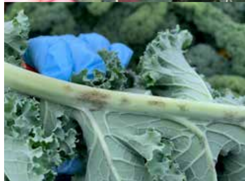
Brassica powdery mildew sporulation on kale (top) and lesions on a kale petiole (bottom).