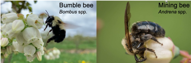
Figure 2. The common wild bees pollinating blueberry crops in central Pennsylvania. Both bumble bee queens (left) and mining bees (right) are active in early spring and are abundant pollinators of blueberries.

Since Pennsylvania lies within the native range of the blueberry, there is a great diversity of native bees that provide pollination services to blueberry farms. Observations performed in three small diversified farms with Bluecrop plantings in central Pennsylvania revealed that the smallest non-commercial planting had the greatest diversity of pollinators. While managed honey bee colonies were present at all sites, they were not commonly observed pollinating blueberries, compared to other wild bees such as bumble bees. For about every honey bee visiting blueberry flowers, we observed about 3 bumblebee queens (Figure 2). Mining bees in the genus Andrena were also a major group of wild bees observed at all sites (Figure 2). Both bumble bee queens and mining bees are active in the spring when blueberry flowers begin to bloom. At least 11 different species of Andrena have been observed pollinating blueberries in central Pennsylvania, often clinging to flowers during their visits.