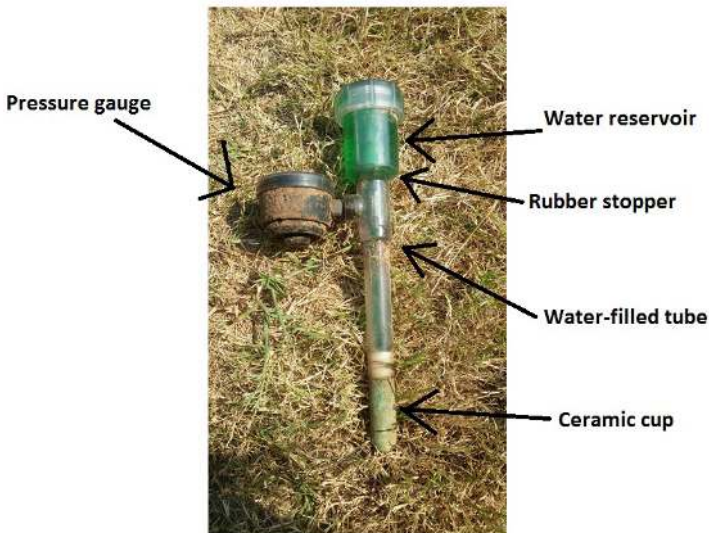
Fig. 1. Diagram of a tensiometer.

The tensiometer estimates the force a plant would need to exert to access soil water by measuring tension. As the soil begins to dry, soil water potential is greater than it is within the tube and water exits through the ceramic tip. This creates a negative pressure (tension) within the tube that is recorded with the pressure gauge. As soil becomes wet from rainfall or irrigation and soil water content increases, the water potential within the tube becomes greater than the surrounding soil, forcing water to re-enter the tensiometer and lowering the pressure.