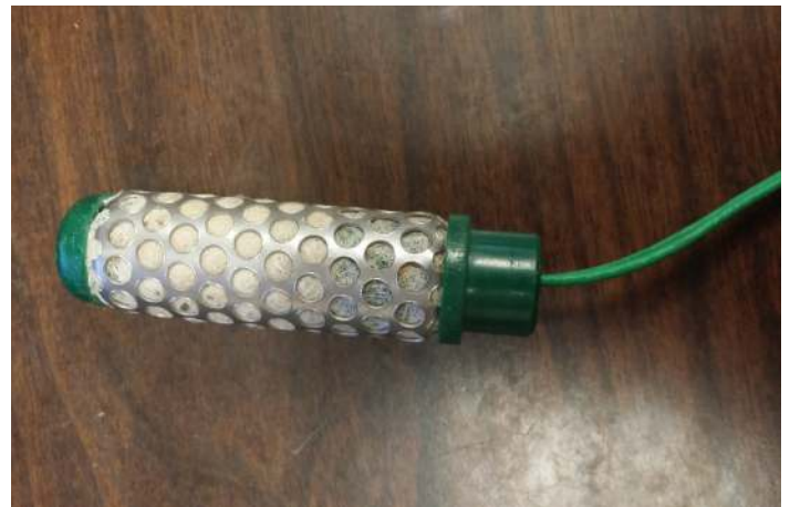
Fig. 2. The Irrometer Watermark is an example of an electrical resistance block.

Gypsum block/electrical resistance block sensors (Figure 2) measure the electrical resistance between two enclosed electrodes in a block of porous material. The electrodes attach to insulated wires that travel to the surface of the soil. These wires then can be connected to a resistance meter with a voltage source, data logger or telemetry system to determine soil water potential based on resistance within the block.