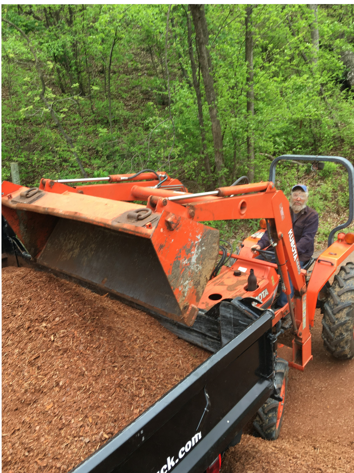
100 cubic yards of pine bark delivered by semi just off the road 500 feet and downhill from the blueberry beds.