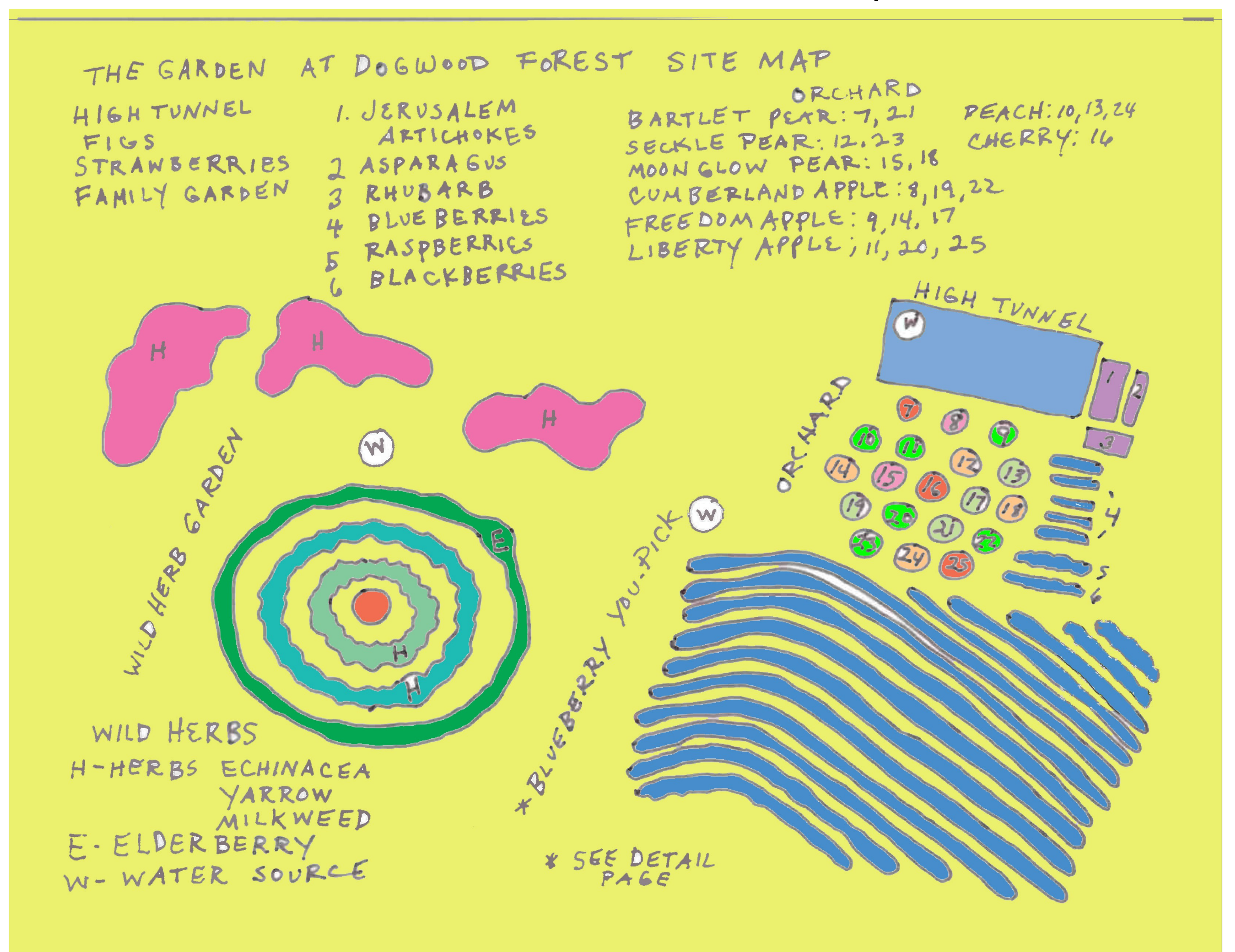
The drawing is a cartoon map taken from an aerial photo of our farm.