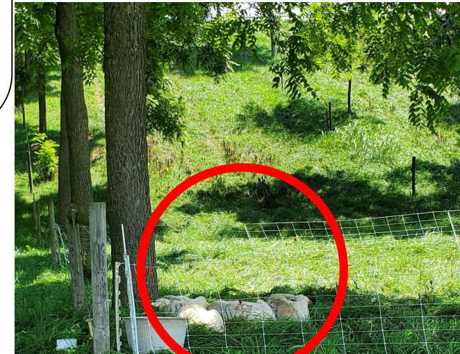
Ewes in BW SP