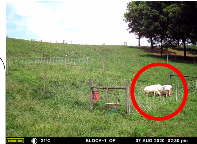
INDUSTRIE 31°C BLOCK-1 OP 07 AUG 2020 02:30 pm

0.9-1.8 °F hotter intravaginal temps between 1200 h-1700 h P \leq 0.04