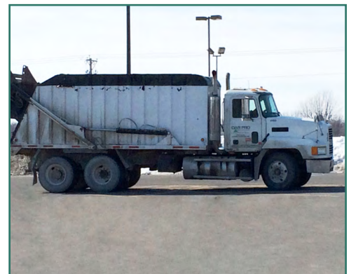
Truck used for dead animal removal.