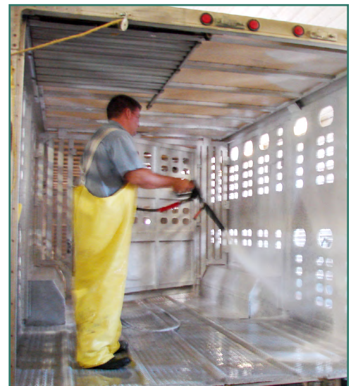
Washing a trailer.