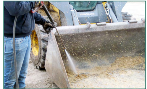
Clean and disinfect heavy machinery.