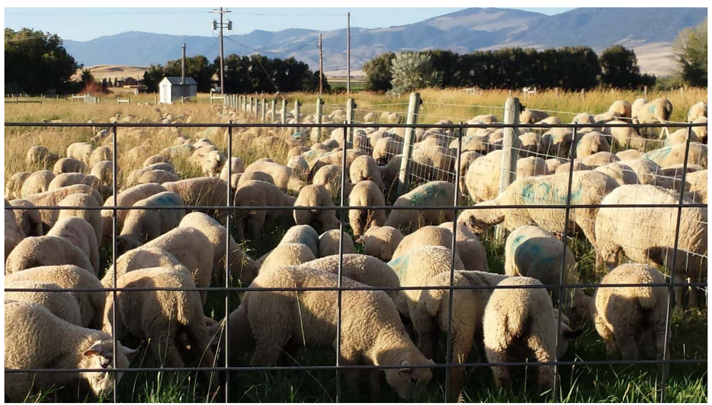
Fence-line weaning begun with ewes on the right and lambs on the left. Note that all heads are down, grazing. After 48 hours, the lambs were gently moved away. Not one bleat and little stress.