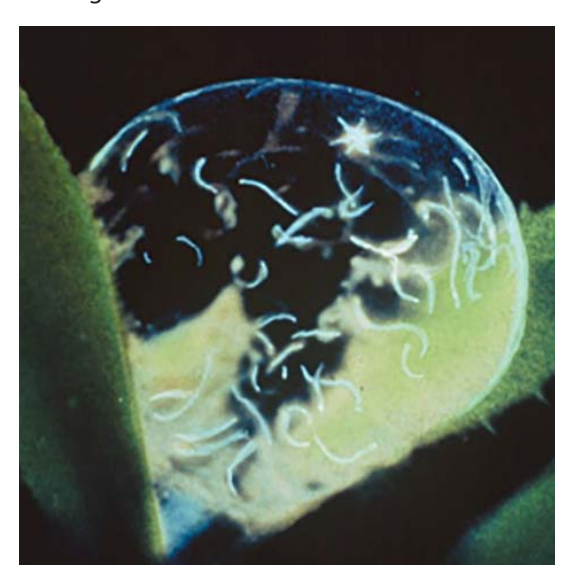
L3 Infective larvae waiting for your sheep to ingest them. You can avoid them by exiting paddocks before L3 larvae get to their perch (four to nine days).

It takes four to nine days after deposition for eggs in the fecal pellet to hatch into L3 larvae and then to crawl up on to their perch in the grass leaf.