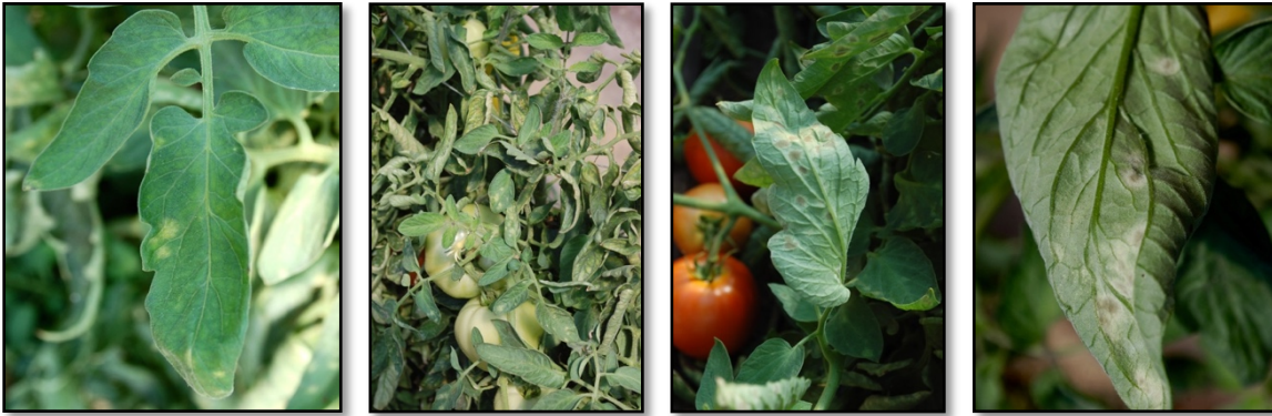
Figure 2. Left to Right: Progression of disease from early symptoms that begin as light green spots. Over time, the spots that are covered with olive-green spores that can be dispersed aerially or by water splash.