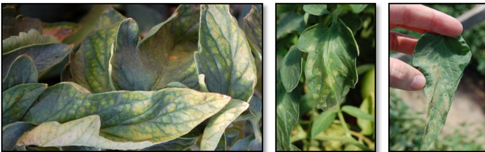
Figure 3. Left: Leaves show signs of magnesium deficiency. Middle: distinct light-green spots caused by tomato leaf mold. Right: an example of tomato leaf mold later in the disease cycle after the fungus has sporulated.