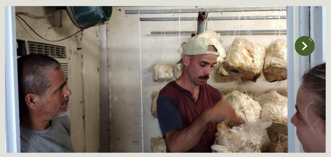
Production increase due to the installment of a new air conditioner