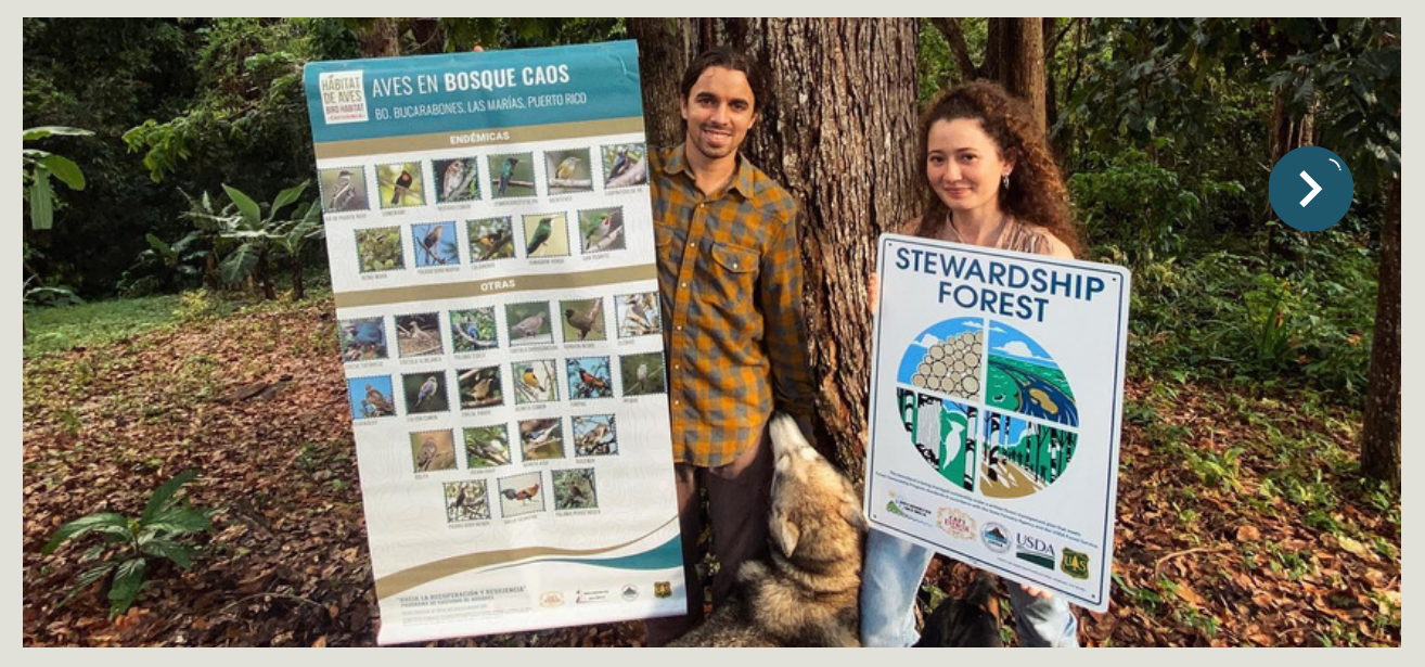
Educational Agrotours materials