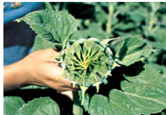
R-3 Top View