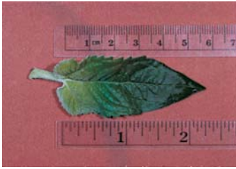
True leaf — 4 cm