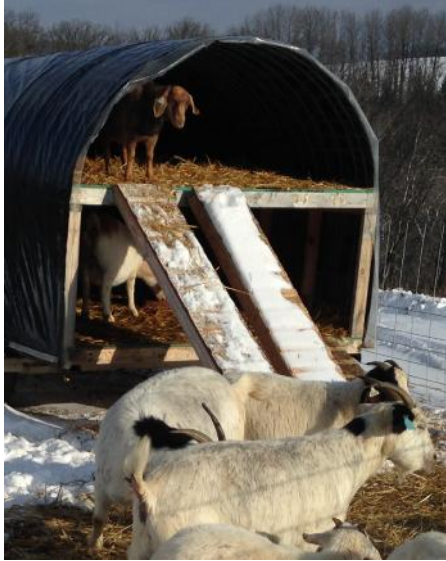
Goat using the upper deck for play during the day