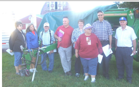
County Extension Committee at Field Tour in September, 2015