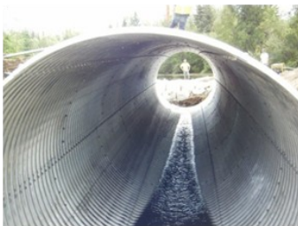
First water in the Persinger Road culvert

Persinger Road crossing was upgraded to improve fish passage for the Chena Slough. This project was completed with funding from the US Fish & Wildlife Service and State of Alaska Legislative funding. Additional partners included the Chena Slough Technical and Neighborhood