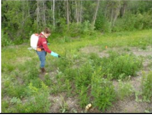
Herbicide application in 2012