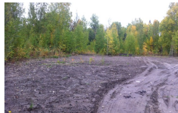
Before planting trees the site was barren ground susceptible to erosion. USFWS funds paid for this restoration project.

The State of Alaska Community Forestry Program donated 300 birch seedlings to the district last spring. Most were planted on local school grounds, with some being potted for use in future projects. Hundreds of Fairbanks-area students were able to plant a seedling and learn more about trees.