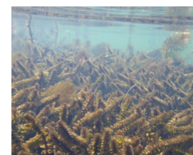
The aquatic invasive Elodea growing in Chena Slough