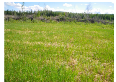
An older hay field in interior AK