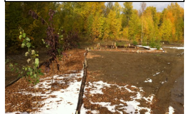
After planting trees at Two Rivers Learning Landscape. Future plans include seeding grass to stabilize the soil.