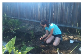
USFWS sponsored youth corps member planting a pollinator garden at JP Jones Center

helping to promote the wise development and conservation of natural resources.