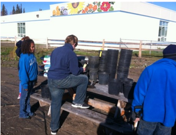
Students potting trees at Woodriver Elementary

The State of Alaska Community Forestry Program donated 300 birch seedlings to the district last spring. Most were planted on local school grounds, with some being potted for use in future projects. Hundreds of Fairbanks-area students were able to plant a seedling and learn more about trees.