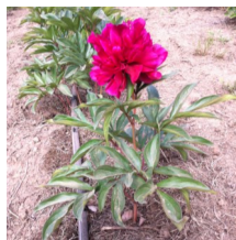
A Soil Testing Program customer’s peony farm

including Nenana, Fairbanks, Healy, Cantwell, and Barrow. These programs resulted in actual restoration projects such as rain and pollinator gardens, tree plantings, trail work, and riparian area improvement. FSWCD assisted NRCS with the farm energy audit program and worked to promote rural energy assistance. A dialogue was started with Alaska Miners Association and local placer miners to help them continue their operations utilizing best management practices as they come under numerous and complicated types of government scrutiny and regulations. Our district was awarded management of the statewide Agriculture in the Classroom program to teach agricultural literacy. FSWCD was also excited to be part of the successful commitment to open the Nenana/Tochaket area to land use as well as the road between Manley and Tanana.