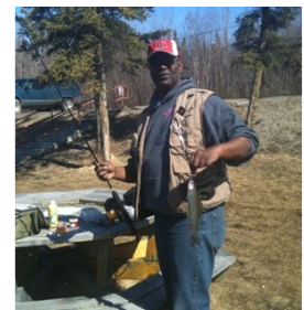
A fisherman on Chena Slough (Peede crossing)

Committees. FSWCD has helped replace 8 culverts along the Chena Slough, with the long-term goal to replace 3 more. Culvert replacement is just one of the many ways in which FSWCD is working to restore the waterways in our district.