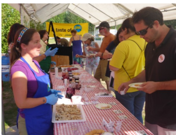
Handing out berry and jam samples

FSWCD received a grant from the Alaska Division of Agriculture to help pay for a promotional event for local berry products and the growing of berry plants in interior Alaska. Over 200 people visited the event and most were very excited about the delicious samples and useful