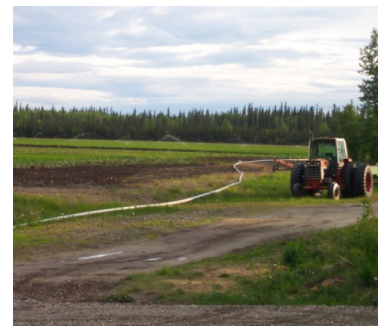
A grain farm in interior Alaska