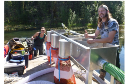
Photos: (Above) The Elodea pontoon boat w/ suction dredge. (Below) A diver using the suction dredge to remove Elodea

The Alaska Division of Agriculture has established a quarantine at the boundaries of Alaska preventing the entry and spread of five aquatic invasive plants, including Elodea canadensis and Elodea nuttallii . The bill prohibits the import, transport, sale and purchase of Elodea in the State of Alaska.