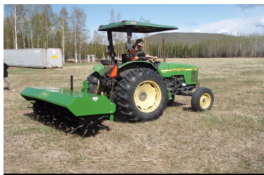
FSWCD aerator pulled behind a tractor

Weed sprayers and an aerator are available to borrow for FSWCD cooperators.