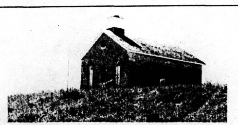
The Lower Fox Creek School is one of several stone buildings included in the tour of the Z Bar Ranch.