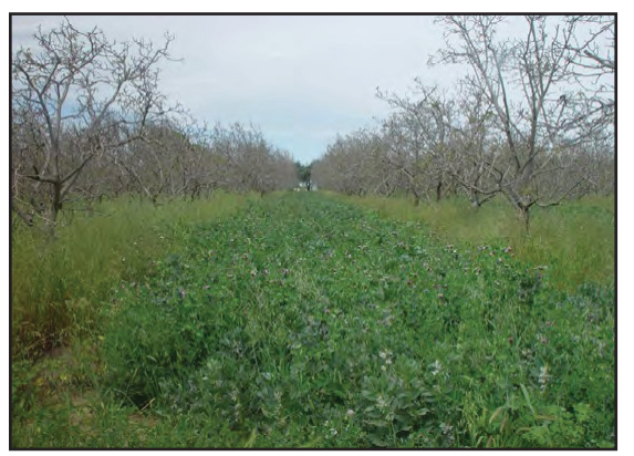
Figure 19: Walnut orchard floor prior to grazing. Note the tall grasses and mix of cover crop species compared to the grazed orchard floor on the right.

Grazing: Depending on the cover crop's purpose, grazing can be an effective method for cover crop management. Grazing removes a substantial portion of the vegetation and may interfere with the goal of enhancing soil organic matter. Grazing animals deposit manure and urine on the soil which has nutrient management as well as potential food safety implications. Producers should consult with their organic certifier as well as NRCS prior to grazing any cover crops.