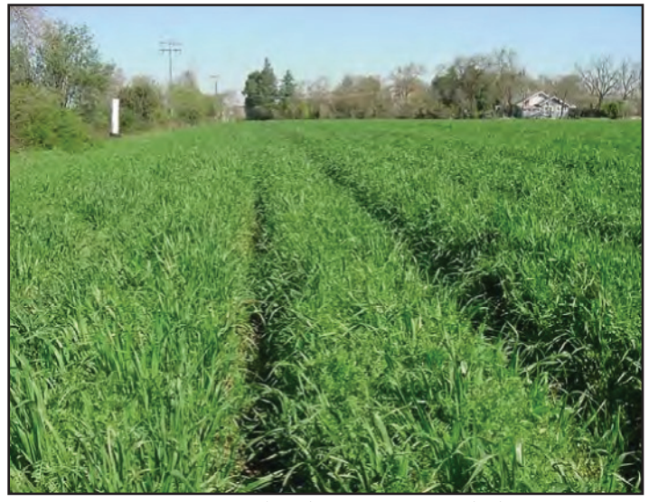
Figure 6. Vetch and rye cover crop on beds.

Annual vegetable operations may have fields with compaction or a plowpan layer where heavy equipment has been run frequently. Clay soils with low organic matter, or those with heavy traffic and grazing, are especially vulnerable to compaction. Compacted soils may not allow rainfall or irrigation water to infiltrate the lower soil horizons, so some deep ripping may be required. While this is more of an issue for cash crops, it could impact the establishment of a non-irrigated cover crop. Subsoiling should be done when soil is dry, often before seeding a fall cover crop. Cover crops such as tillage radish can also be used specifically for the purpose of breaking up compacted soils.