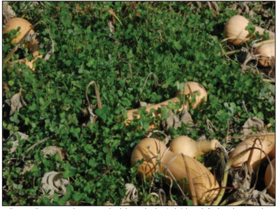
Figure 11. Butternut squash oversewn with red clover in late June/early July just before last cultivation and canopy closure.

nutrient competition. Producers may consider using a more shade tolerant variety based upon the crop they are seeding. White clover, annual ryegrass, rye, hairy vetch, crimson clover, red clover and sweet clover tolerate some shading (Clark, 2007). Broadcasted seed should be heavy enough to fall through the crop canopy. More information about relay-seeded cover crop opportunities and rotations can be found in Table 4, Appendix A.