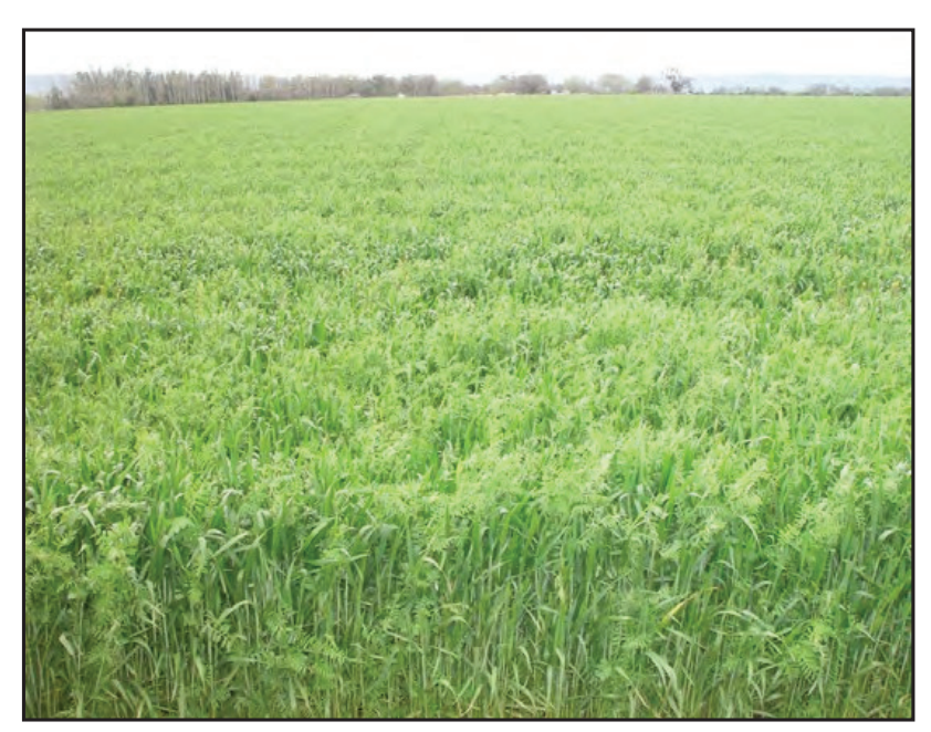
Figure 5. Stand of a vetch and oats, unbedded.

To establish a cover crop successfully, field preparation is the first critical component to address. Two of the primary issues to consider are weed management and the development of a smooth seed bed for good seed-to-soil contact. Ideally field preparation will mirror that for annual cash crops, but can be less intensive. Soil should be worked at an appropriate moisture level to be free of clods and ensure good seed-to-soil contact. In order to gain the maximum benefit from the cover crop, producers should provide appropriate moisture. In some cases producers can relay seed into young vegetable plantings at the end of the weed management period and establish cover crops with no seedbed preparation or seed incorporation. If cash crops are harvested very late, consider relay seeding options, or broadcast annual ryegrass and common vetch after harvest.