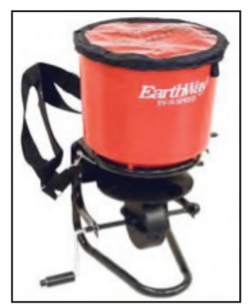
Figure 9: A broadcast seeder, or 'belly grinder', appropriate for small acreage seeding. (Earthway).

One major problem with many methods of incorporating broadcast seed is that often they place the seed too deep, requiring seeding rates 1.5 to 2 times higher than drilling. However, if not set properly, seed drills can easily place seeds too deep as well. Conversely, it is equally important not to place seeds too shallow and avoid them being eaten by birds or drying out after germination and before establishment. Use the recommended seed depth for each cover crop species and be especially careful when seeding mixes. Some drills have an additional hopper where smaller seeds like clover can be placed so that they are