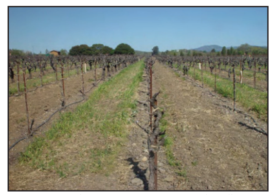
Figure 21. Disking cover crops in every other alley in a vineyard allows the grower access to all vines when the rainy season arrives and keeps down dust.

Cover crops are an important component of organic orchard floor management. They may be planted in the grass alley, legumes planted for nitrogen, or flowering species planted for beneficial insects. While living mulches in the tree row are often used, cover crops can also be grown in the alley and used on the tree row. Often called "mow and blow," this system blows clippings from mowing the alley on to the tree row with side discharge mowers. The alley planting can be grass that produces biomass for mulch,