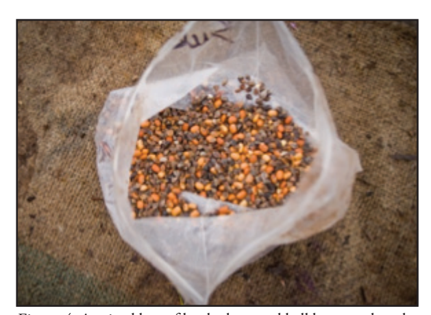
Figure 4. A mixed bag of buckwheat and bell bean seed ready for broadcasting.

The use of rhizobial seed inoculants for legumes is encouraged to ensure a robust nodulation of legume roots. Make sure that the correct inoculant is used for each type of legume that is seeded. Inoculants may be required by NRCS if the purpose of the cover crop is to provide biological nitrogen fixation. Producers should ensure inoculants are not genetically modified and confirm with their certifier as needed before applying any new input on their farm.