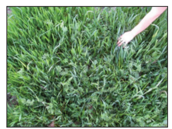
Figure 3. Fall seeded annual rye, vetch, winter peas, favas, and crimson clover serve multiple purposes in Western OR. (Sarah Brown)