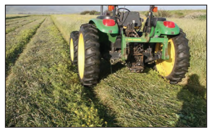
Figure 18: Terminating cover crops on beds using a roller crimper. (Eric Brennan)

Grazing: Depending on the cover crop's purpose, grazing can be an effective method for cover crop management. Grazing removes a substantial portion of the vegetation and may interfere with the goal of enhancing soil organic matter. Grazing animals deposit manure and urine on the soil which has nutrient management as well as potential food safety implications. Producers should consult with their organic certifier as well as NRCS prior to grazing any cover crops.