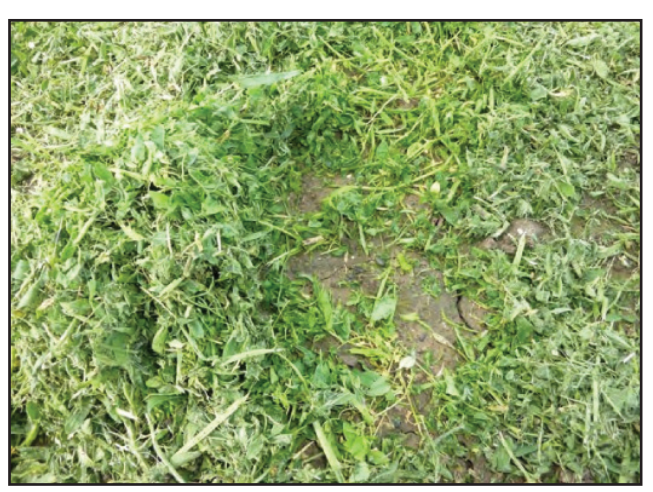
Figure 14: Residue of vetch cover crop is about 3-4" thick. In this situation the residue was be allowed to dry down, and then lightly incorporated with a Lilliston cultivator.

Tillage or Disking: Tillage or disking is generally used to incorporate crop residue into the soil. If the amount of residue is small, it might be left on the surface. Lilliston cultivators can be used for light amounts of residue, but for higher biomass covers, or for crops with dense root masses, such as sorghum-sudan, disking or spading the residue into the soil is needed before the next crop is planted. If cover crop residues can be left on the surface, the risk of erosion can be reduced.