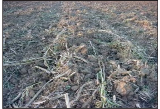
Figure 15. A field one week after disking down a robust legume cover crop and vetch. After the residue decomposes further, the producer will disk one more time prior to forming the planting beds.

Tillage or Disking: Tillage or disking is generally used to incorporate crop residue into the soil. If the amount of residue is small, it might be left on the surface. Lilliston cultivators can be used for light amounts of residue, but for higher biomass covers, or for crops with dense root masses, such as sorghum-sudan, disking or spading the residue into the soil is needed before the next crop is planted. If cover crop residues can be left on the surface, the risk of erosion can be reduced.