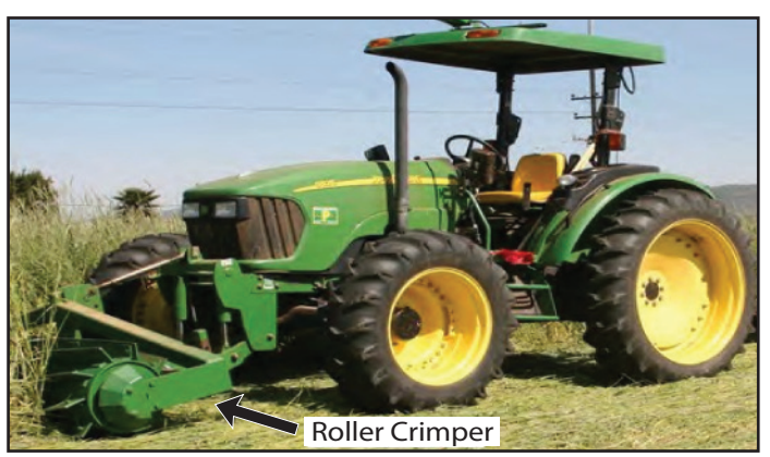
Figure 17: This rye cover crop was terminated using a roller crimper.

Cover crop varieties and timing of termination are crucial components to ensure success in an organic system. Cover crops must reach early flowering to be effectively terminated with roller crimpers. For more information see 'Organic No-Till Farming' listed in resources, Appendix B.