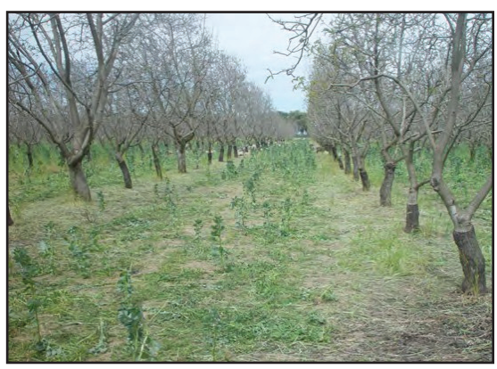
Figure 20: This organic walnut orchard has been grazed by sheep which left the bell beans standing, but devoured the Austrian peas, vetch, and in-row grasses.