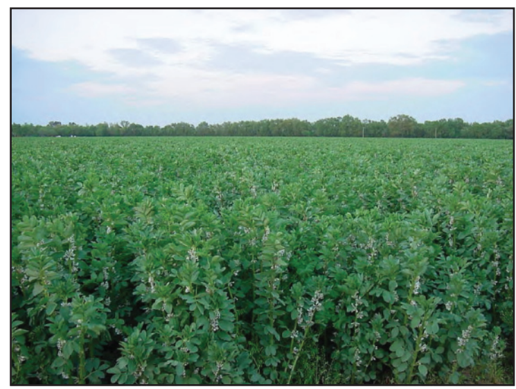
Figure 2. Six-foot-tall fava bean cover crop, Fong Farms, Woodland, California 2006.

Funded by a grant from Western Sustainable Agriculture Research and Education (WSARE).