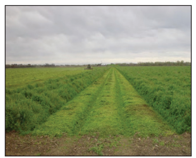
Figure 13: Flail-mowed vetch beds.

Mowing: Mowing is often used to terminate a flowering cover crop before incorporation with a disc. It is a quick method to ensure that cover crops do not go to seed. There are three basic types of mowing machines: sickle bar, rotary and flail. Sickle bars are fast and leave large pieces of stalks on the surface of the ground. They are optimal for a slow decomposing mulch to cover the soil. Rotary mowers (like those commonly used for lawns) are useful in orchard settings to cut groundcover close to trees, but they do not chop residue, leaf litter and prunings as finely as flail mowers. Flail mowers generally require more horsepower than rotary mowers and provide a finer chop may allow for slightly quicker decomposition of the residue. Some producers might opt to transplant directly into a mowed cover crop, a minimum-till option that is usually easier to adopt than roller crimpers. Be aware of challenges inherent with this approach such as cooler, wetter soils and potential pest problems (i.e rodents or slugs).