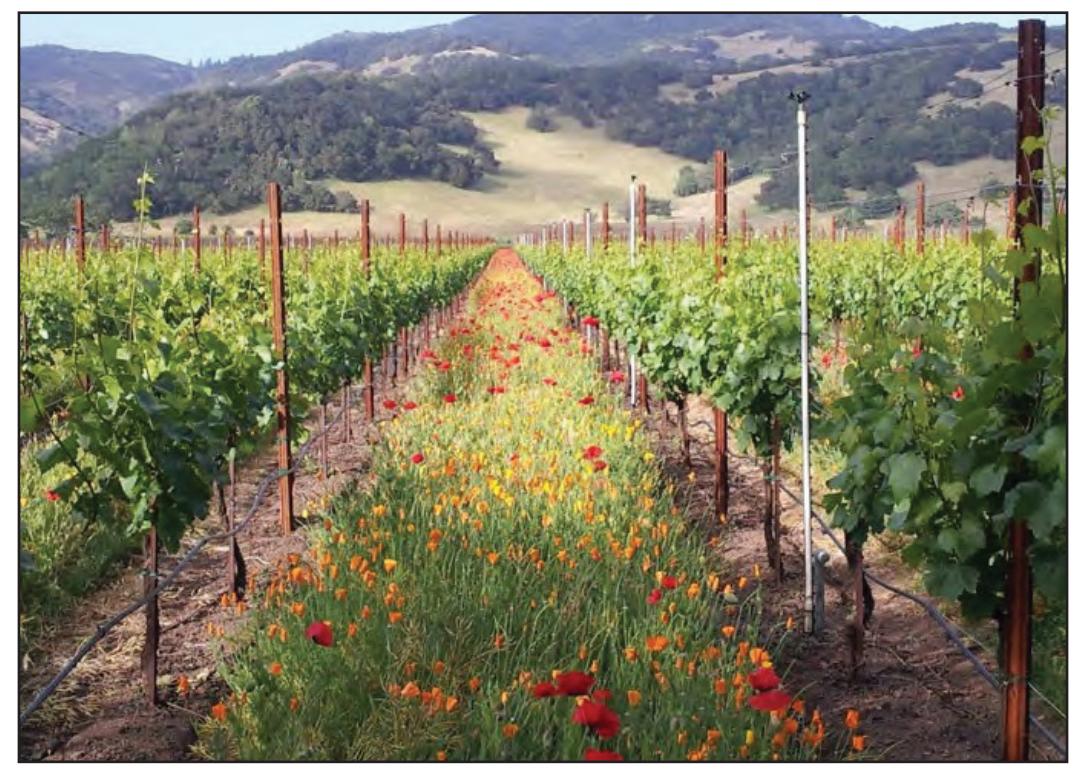
Figure 22. This cover crop in a vineyard provides good habitat for beneficial insects and is aesthetically pleasing.