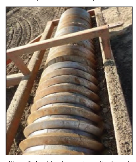
Figure 8: A cultipacker, or ring-roller, is used to firm the soil surface which helps seed-to-soil contact and breaks clods of soil. They can be used successfully to lightly incorporate cover crop seed.

Cover crops can be planted in the fall, spring, or even the summer. The timing depends on the purpose for implementing the practice as well as equipment and the cover crop species chosen. In the maritime Pacific Northwest, during most years a cover crop planted in the fall can germinate and grow simply on rainfall. However, it may require sprinkler irrigation in order to bring up a fall-planted cover crop if the rains are late or it is a dry year. A summer cover crop will be more expensive because in most locations it will require irrigation and involves a higher opportunity cost as a cash crop is foregone during the main growing season. Drought tolerant summer cover crops like Sudan x Sorghum hybrids can grow well with little to no