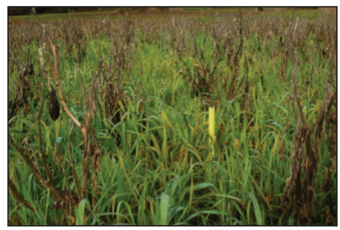
Figure 10. Eggplant oversewn with oats in Western Oregon. (Nick Andrews)

In a western context, establishment of a relay-seeded cover crop will depend on the type of irrigation used. Sprinkler or furrow irrigation will support this approach, but over-seeding into a field using buried drip will likely not be successful. Ideally, over-seeding should occur just prior to a rain event or scheduled irrigation. Over-seeding will likely require higher seeding rates to overcome light, moisture, and