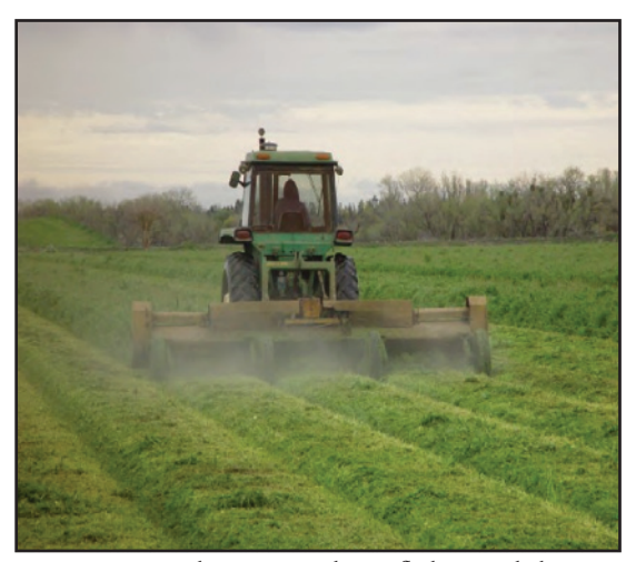
Figure 12: Vetch cover crop being flail mowed close to the bed surface.

Mowing: Mowing is often used to terminate a flowering cover crop before incorporation with a disc. It is a quick method to ensure that cover crops do not go to seed. There are three basic types of mowing machines: sickle bar, rotary and flail. Sickle bars are fast and leave large pieces of stalks on the surface of the ground. They are optimal for a slow decomposing mulch to cover the soil. Rotary mowers (like those commonly used for lawns) are useful in orchard settings to cut groundcover close to trees, but they do not chop residue, leaf litter and prunings as finely as flail mowers. Flail mowers generally require more horsepower than rotary mowers and provide a finer chop may allow for slightly quicker decomposition of the residue. Some producers might opt to transplant directly into a mowed cover crop, a minimum-till option that is usually easier to adopt than roller crimpers. Be aware of challenges inherent with this approach such as cooler, wetter soils and potential pest problems (i.e rodents or slugs).