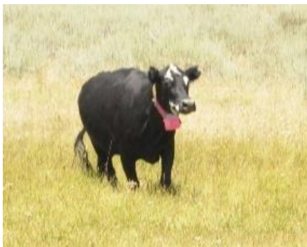
Demonstrating use of GPS collars on range cattle, Plumas County.