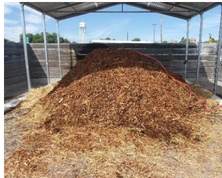
Carcass composting research, Intermountain Research and Extension Center, Siskiyou County.