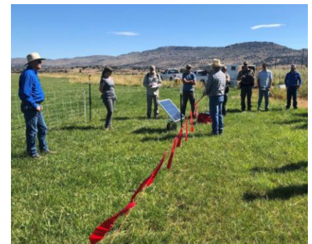
Field day demonstrating fladry use, Lassen County.