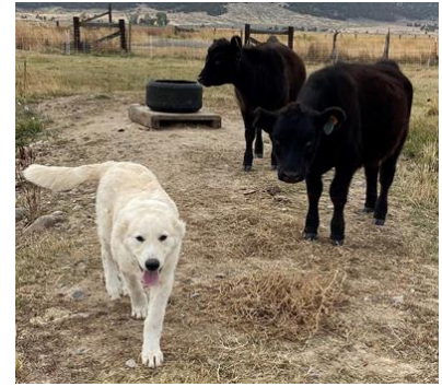
Bonding LGDs to cattle, Modoc County.