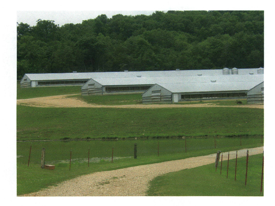
Poultry operation in Arkansas using positive pressure cooling and drop walls.