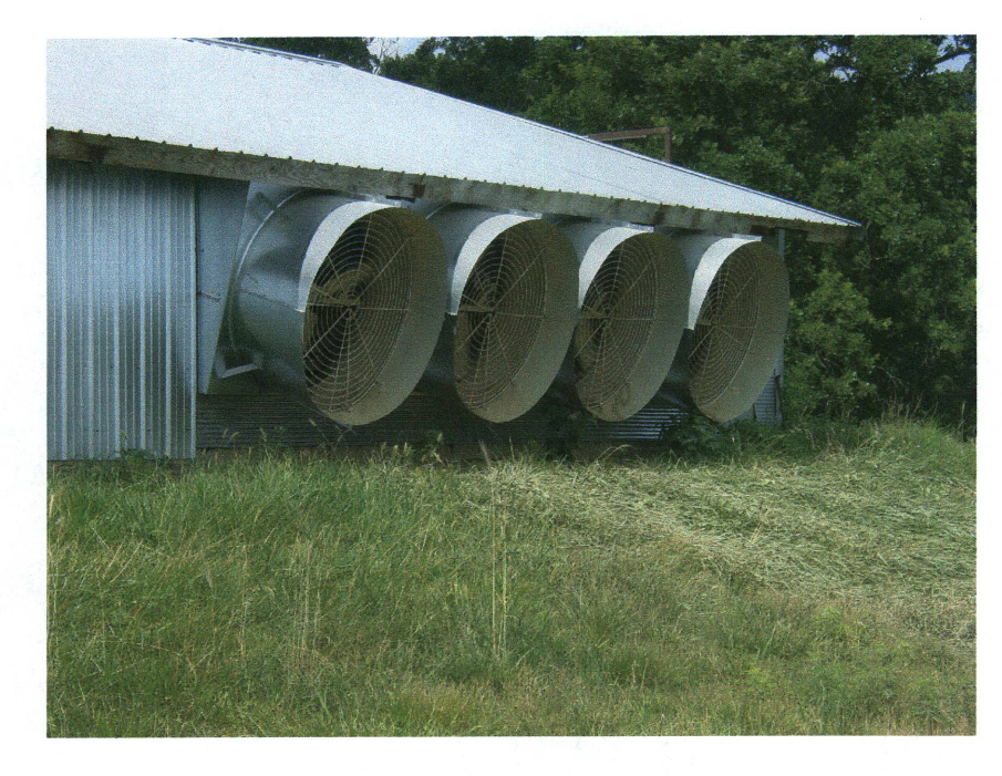
Exhaust fans of tunnel-ventilated poultry production structure.