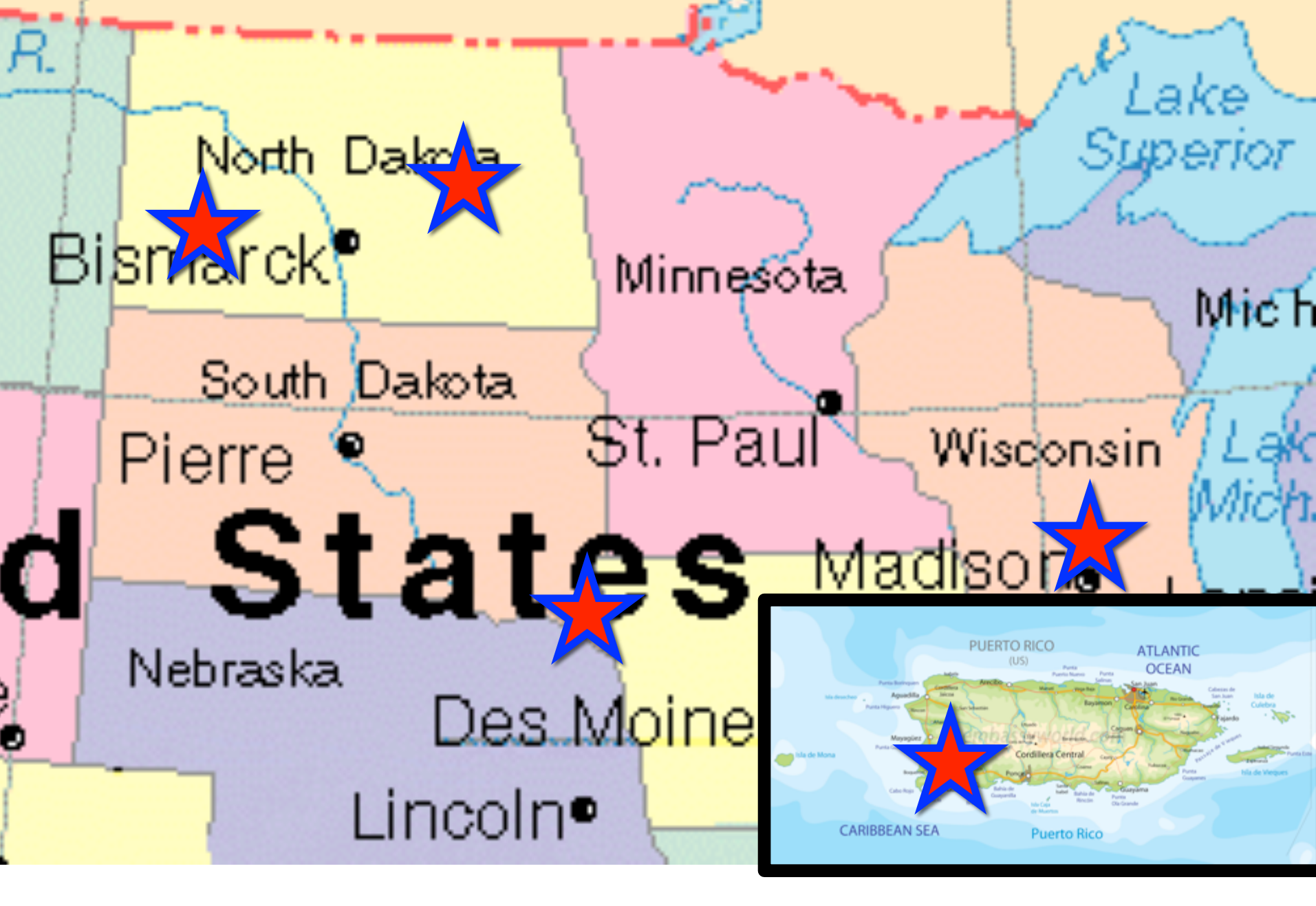
Our Cowpea Study Sites