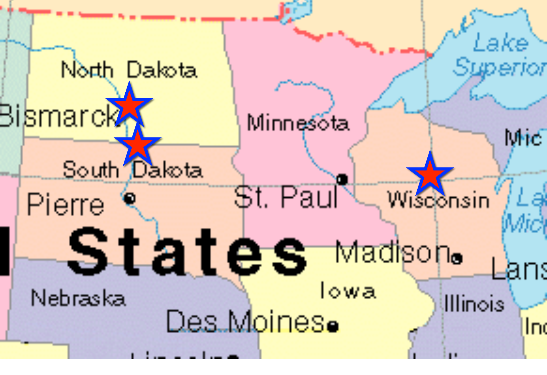
Our Radish Study Sites